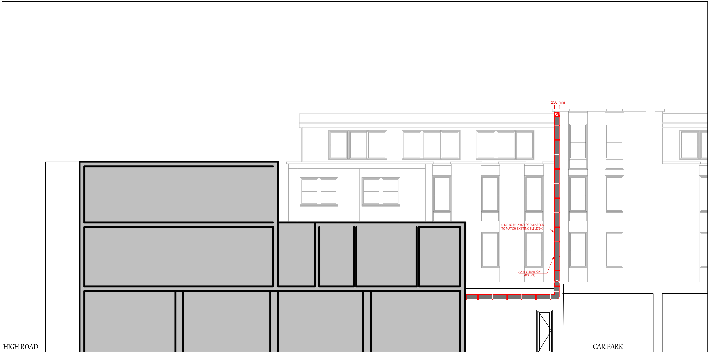
PROPOSED SIDE ELEVATION SCALE: 1/100 @A3