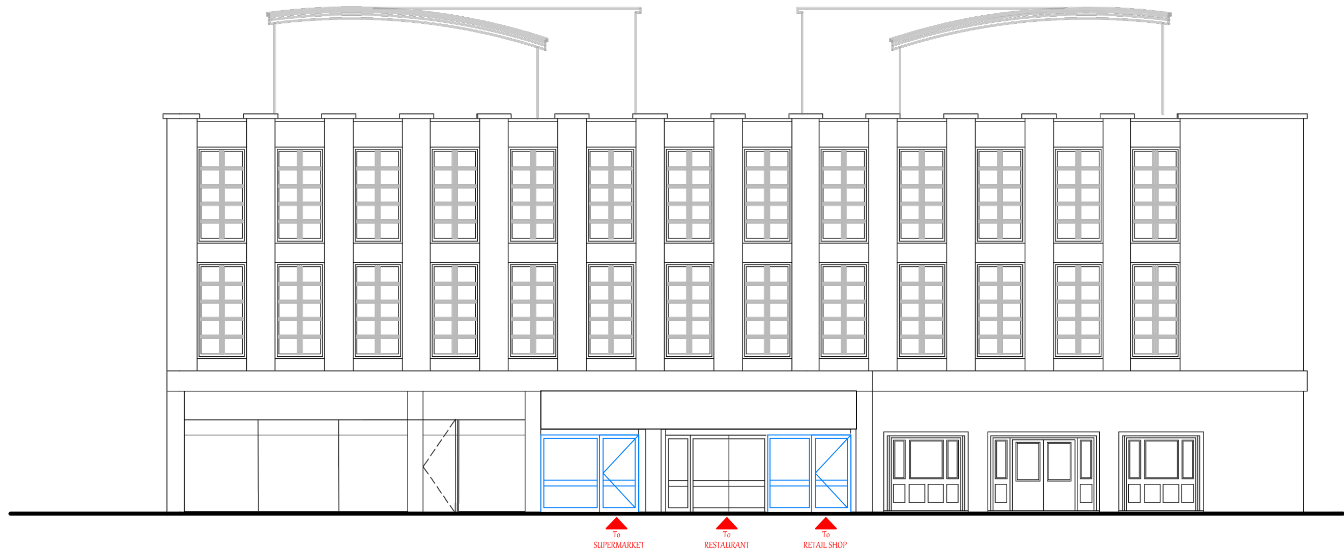
PROPOSED FRONT ELEVATION SCALE: 1/100 @A3