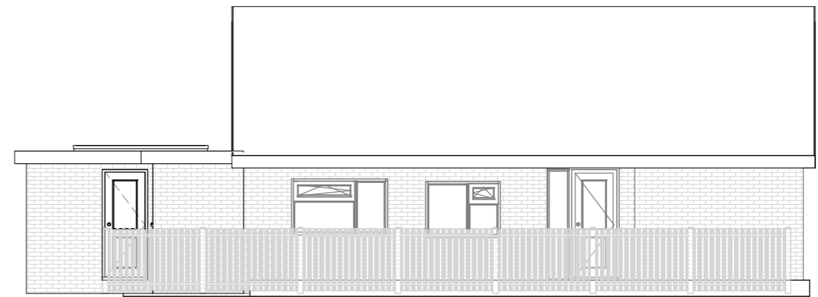
Proposed Elevation-Left side