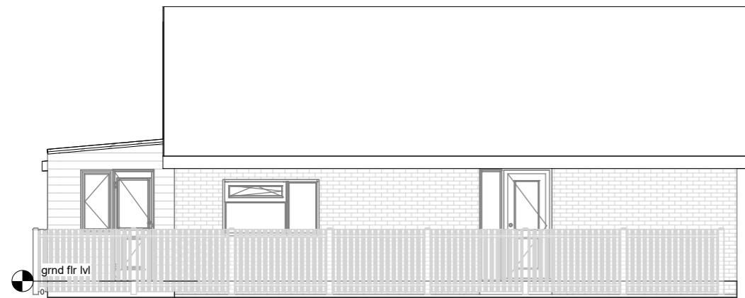
Existing Elevation-Left side