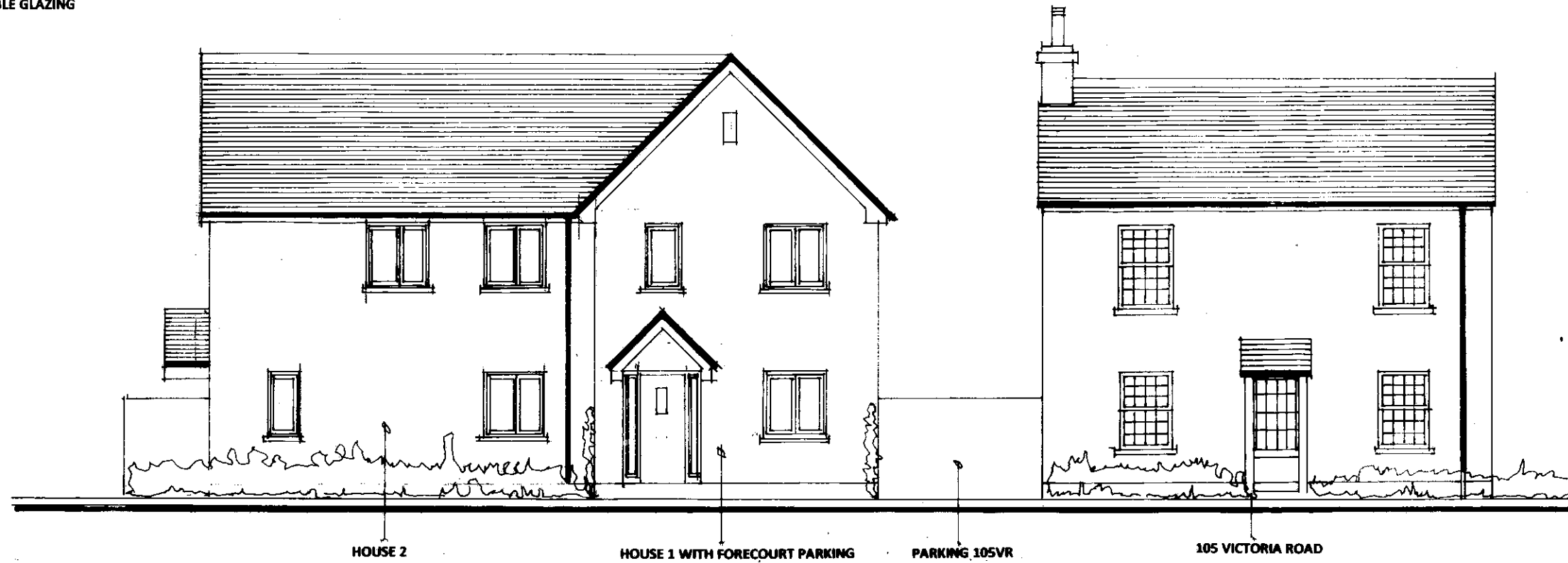
ELEVATION TO VICTORIA ROAD