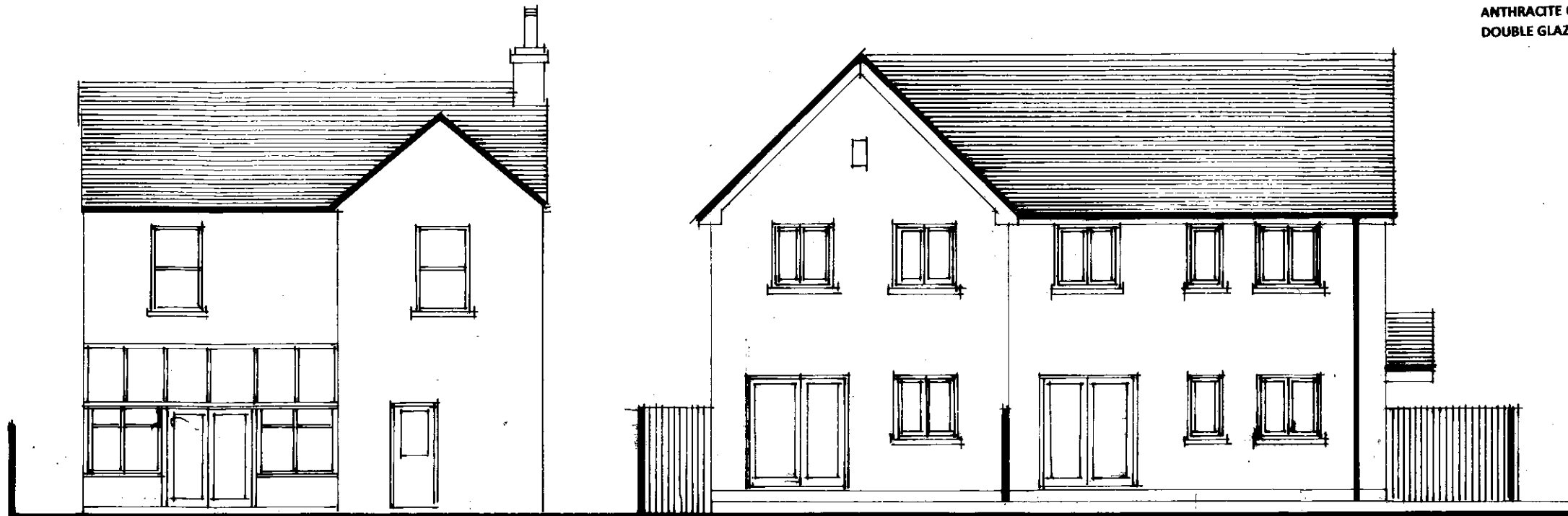
SOUTH ELEVATION OF 105 VICTORIA ROAD TO REMAIN

MATERIALS SLATE COVERED ROOF WITH INSET SOLAR PANELS RENDERED ELEVATIONS ANTHRACITE COLOURED WINDOW FRAMES AND DOUBLE GLAZING