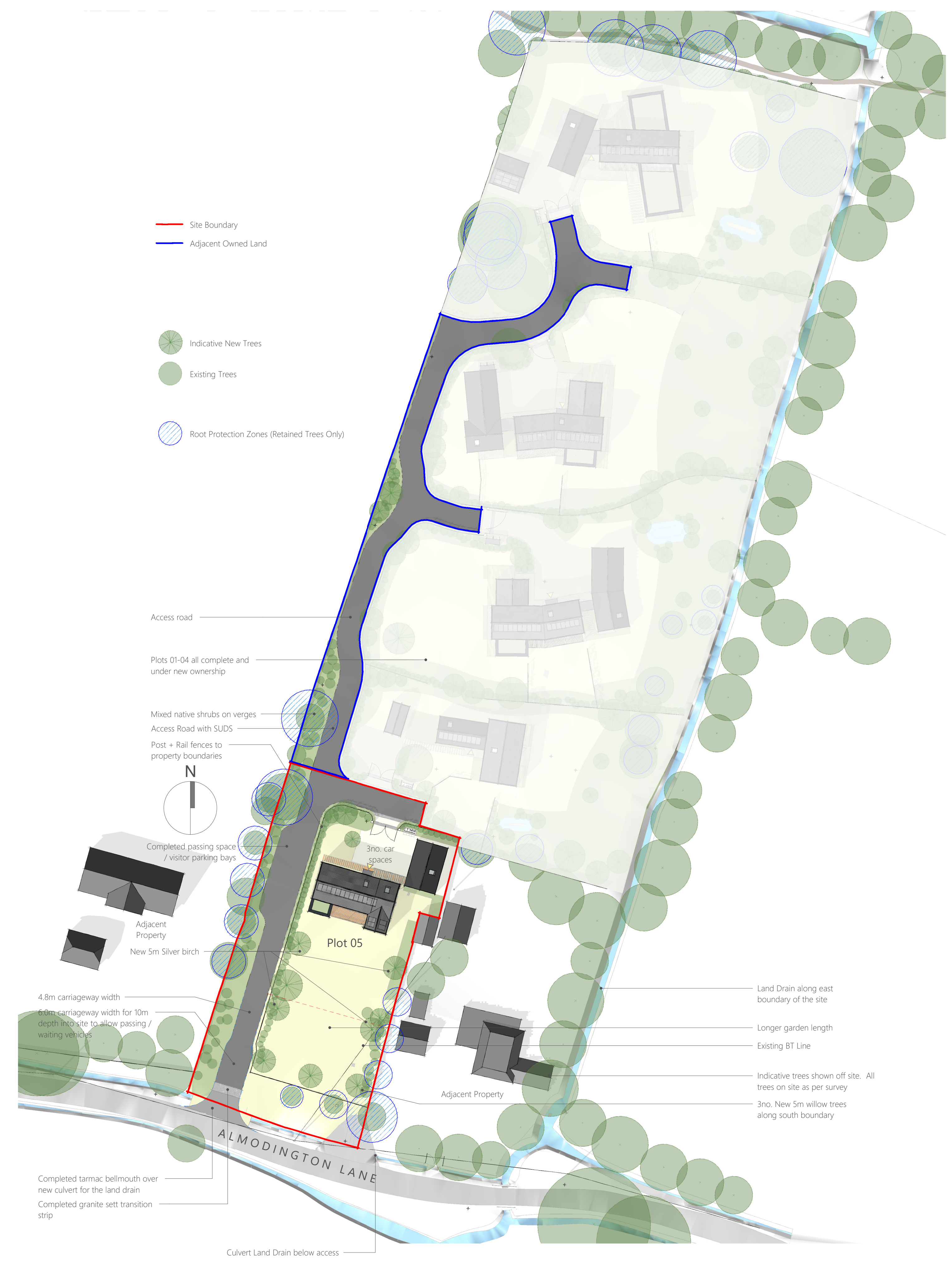
1. Proposed Site Layout Plan scale 1 : 500

THIS IS A COLOURED DRAWING If this box does not appear Red, the drawing may not be represented properly