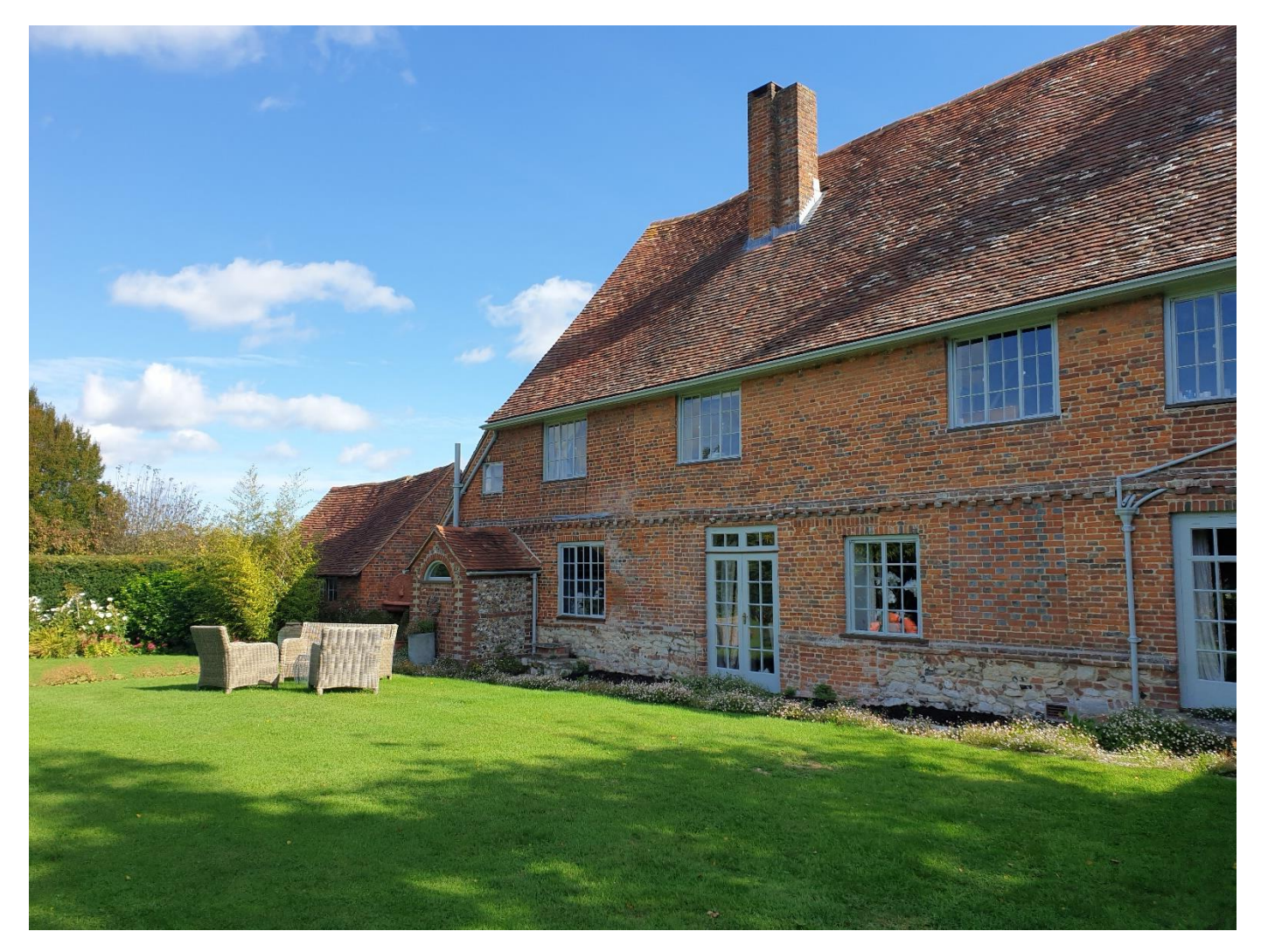
Fig 7 North elevation, view towards proposed dining room addition