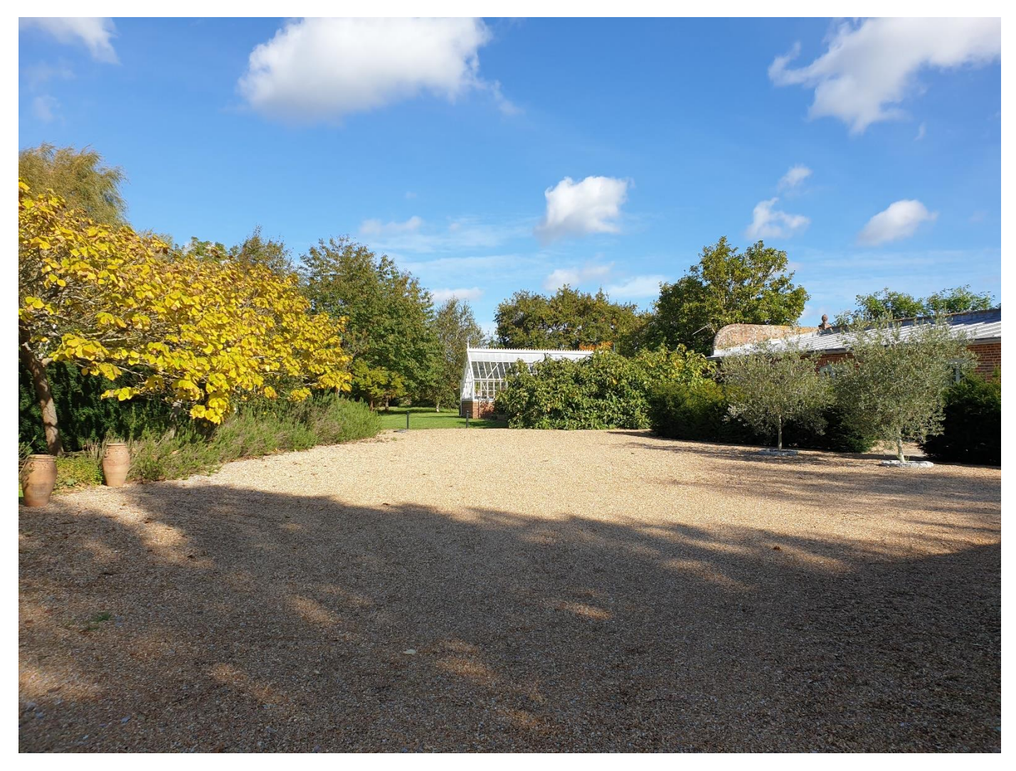
Fig 11 Existing drive to annex, proposed swimming pool location