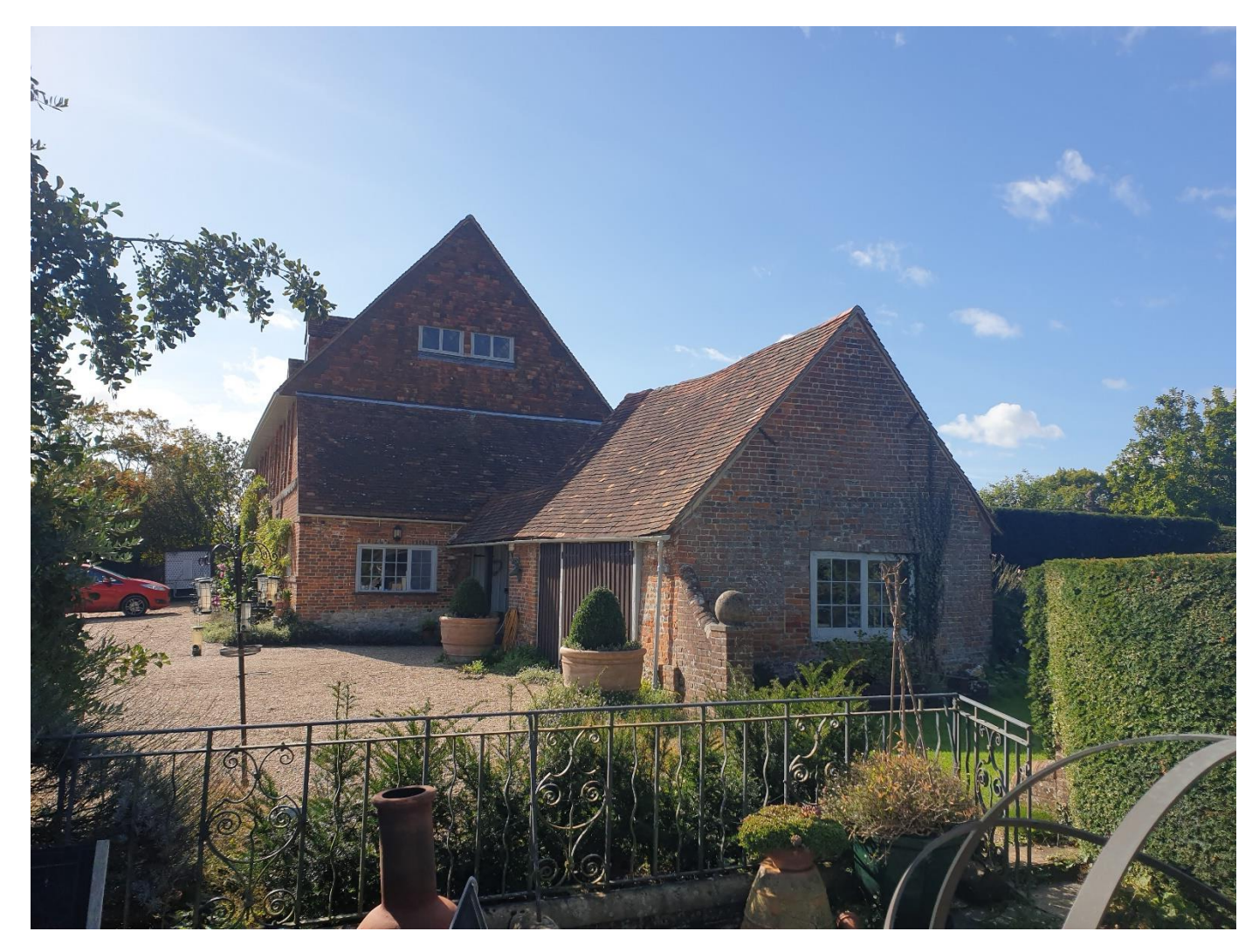
Fig 3 East elevation (note major crack over window & brick alterations