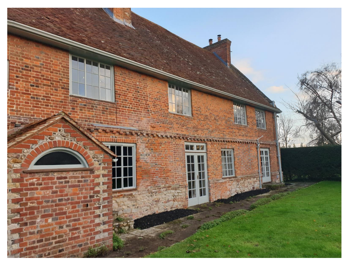
Fig 6 North elevation with bricked in porch