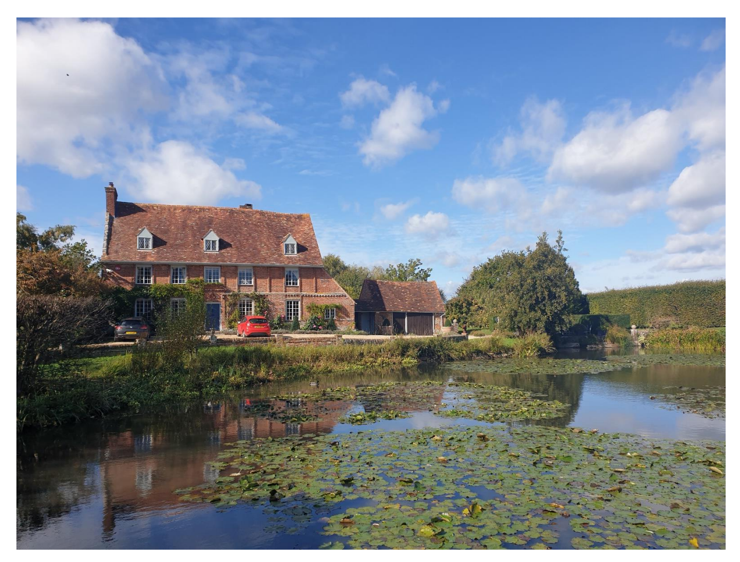
Fig 1 Front (South elevation) garage to RHS