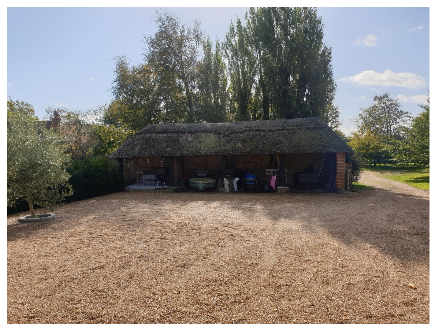
Fig 13 Towards cart barn