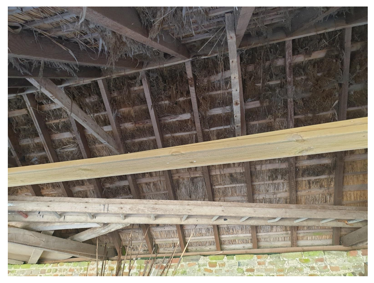
Fig9 Cart barn modern roof timbers