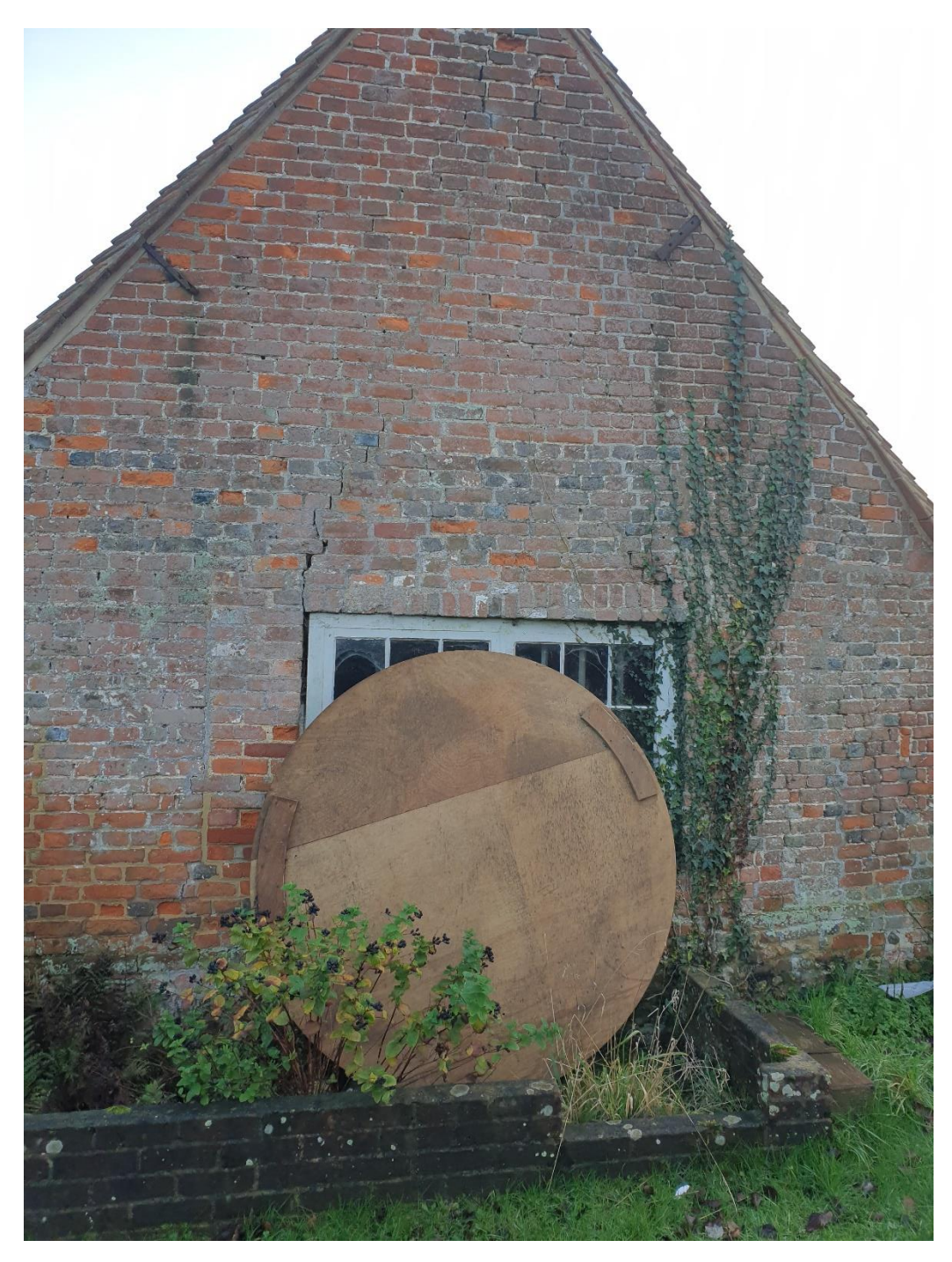
Fig 5 East elevation (garage)