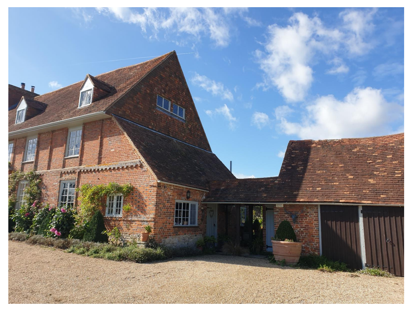
Fig 2 Existing link between garage and house (later addition)