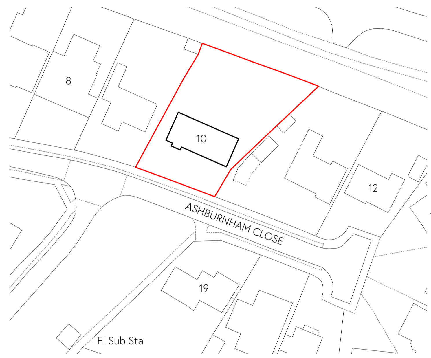
0 5m 10m 15m 20m 25m Block Plan - Existing 1:500