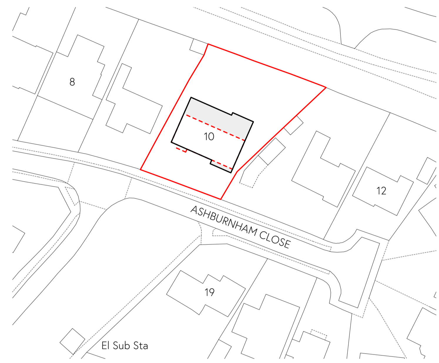
0 5m 10m 15m 20m 25m Block Plan - Proposed 1:500