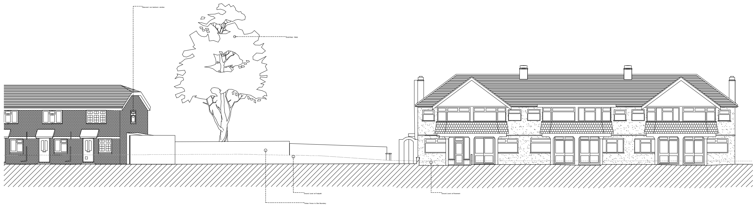
EXISTING ELEVATION C-C