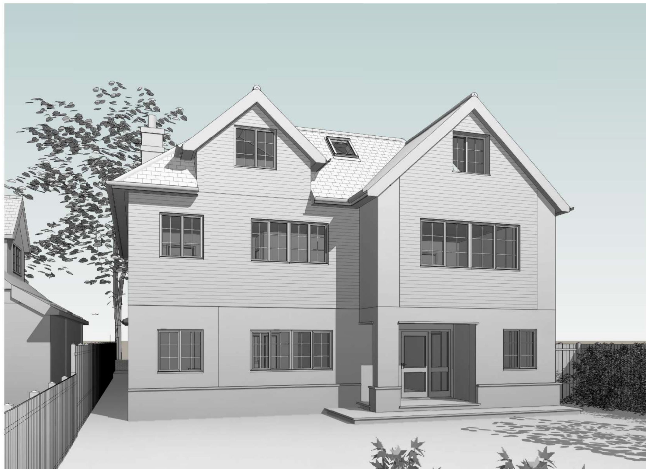
1 Proposed 3D Front View 1