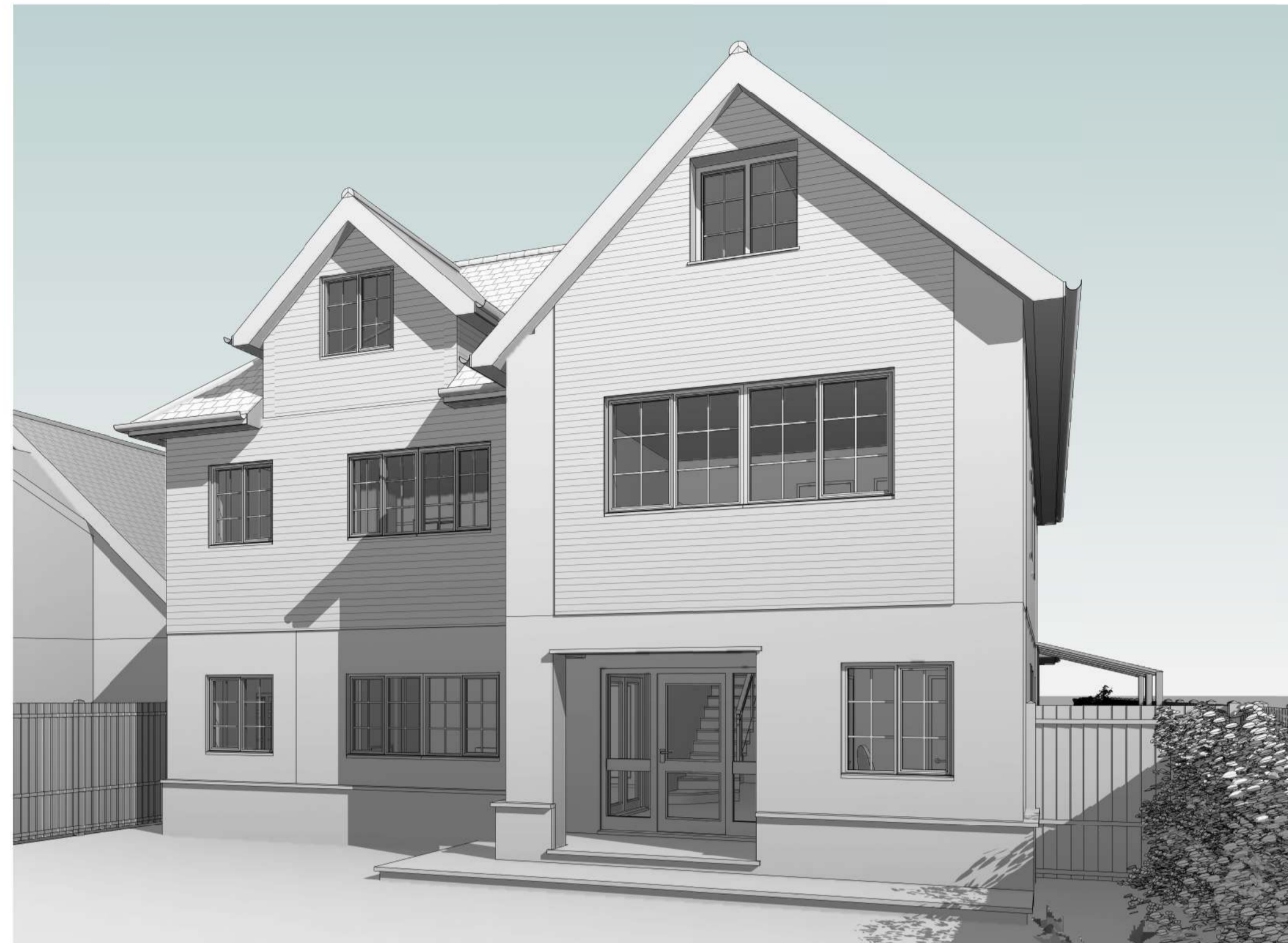
2 Proposed 3D Front View 2