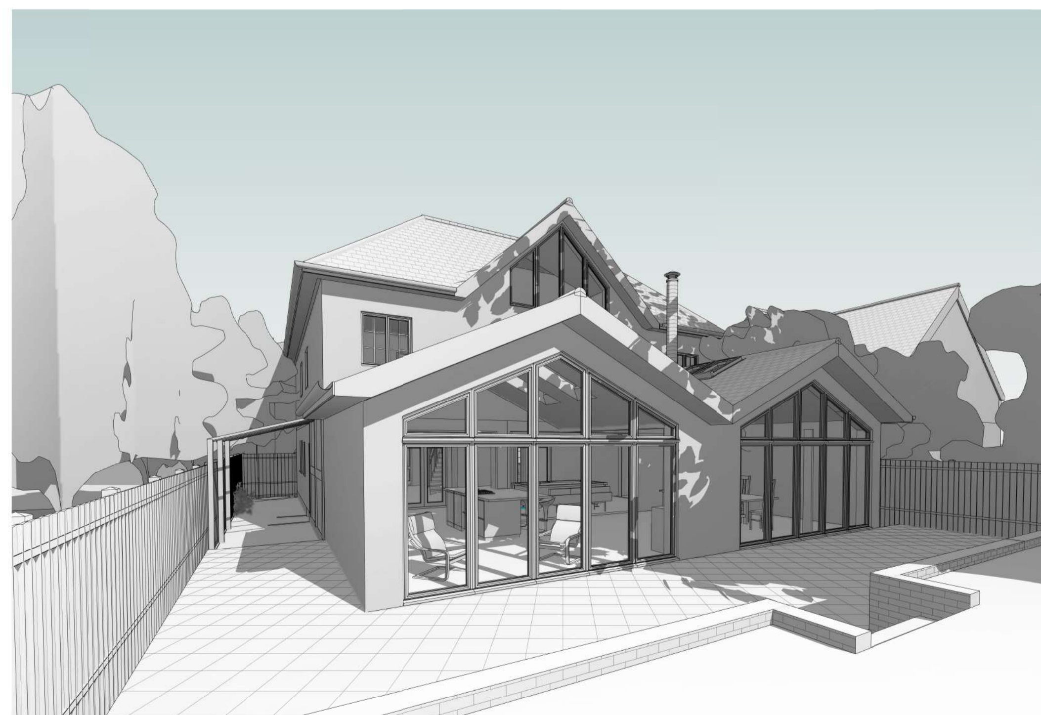
4 Proposed 3D Rear View 2