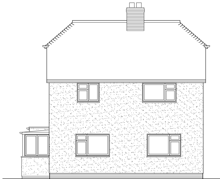
rear - north