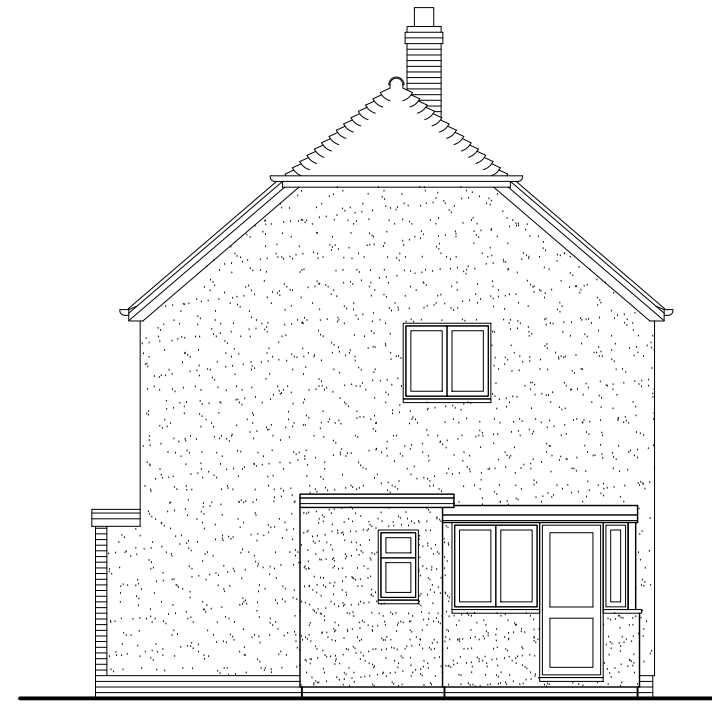
side - east