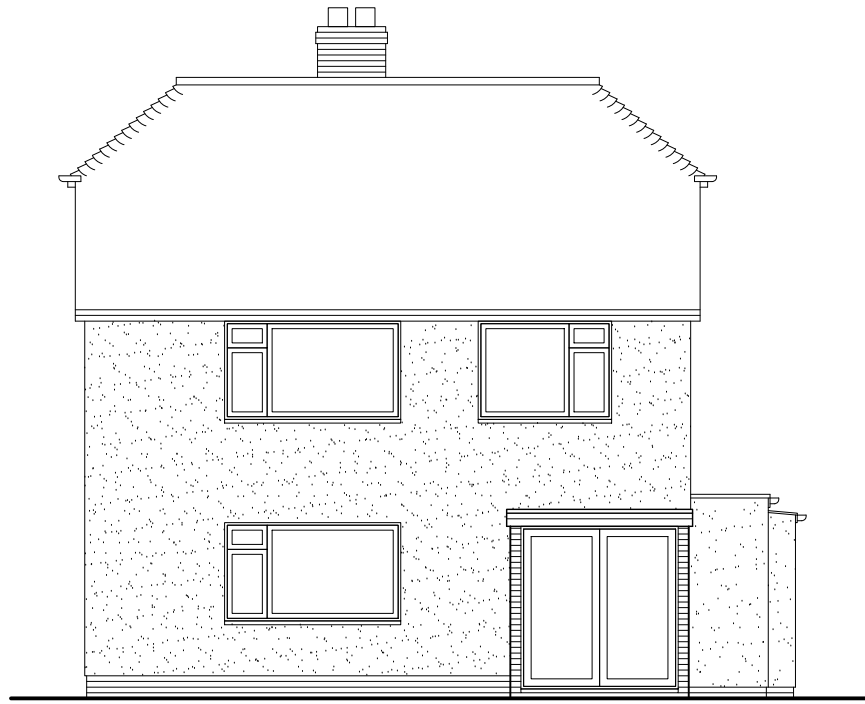
front - south