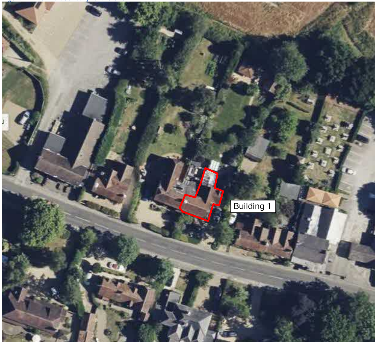
Figure 1. Red line boundary for the Site.

Building 1 – Lavender Cottage, hereafter referred to as ‘the Site’, is situated in the village of Crookham. (NGR ST 93171 95827). An aerial photo view of the site can be seen in Figure 1 below.