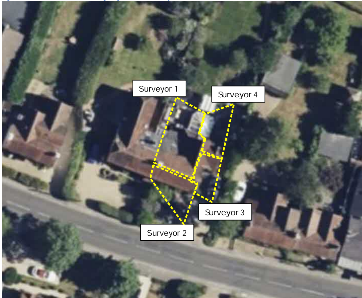
Figure 3. The location and viewing angles of the surveyors.

The surveyors were located in such a way as to achieve coverage of all parts of Building 1 during the surveys. See Figure 3, below, for the locations.