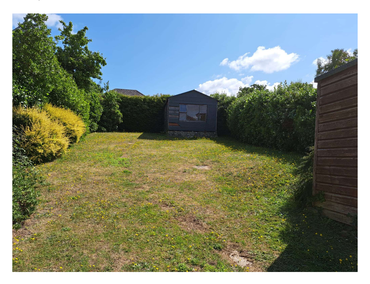
(The picture above shows the rear garden & it's boundaries)

The boundaries to the front garden are made up of a mixture of both shrubs & hedgerow type plants. Within the rear garden which is laid to grass there are two wooden sheds present, the boundaries of the rear garden consist of mature shrubs & small trees, see below: