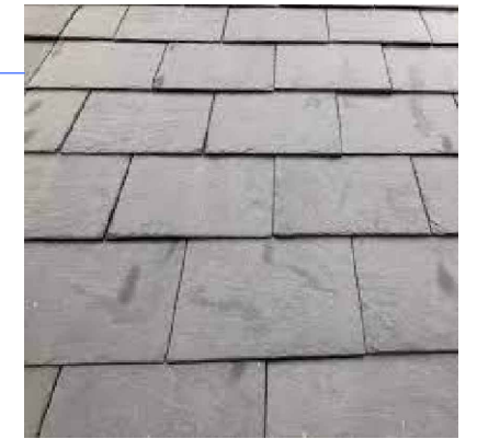
Natural slate roof finish