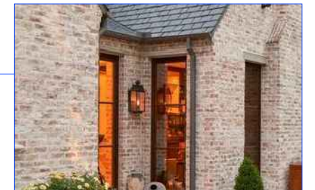
Ground floor facade in facing brickwork