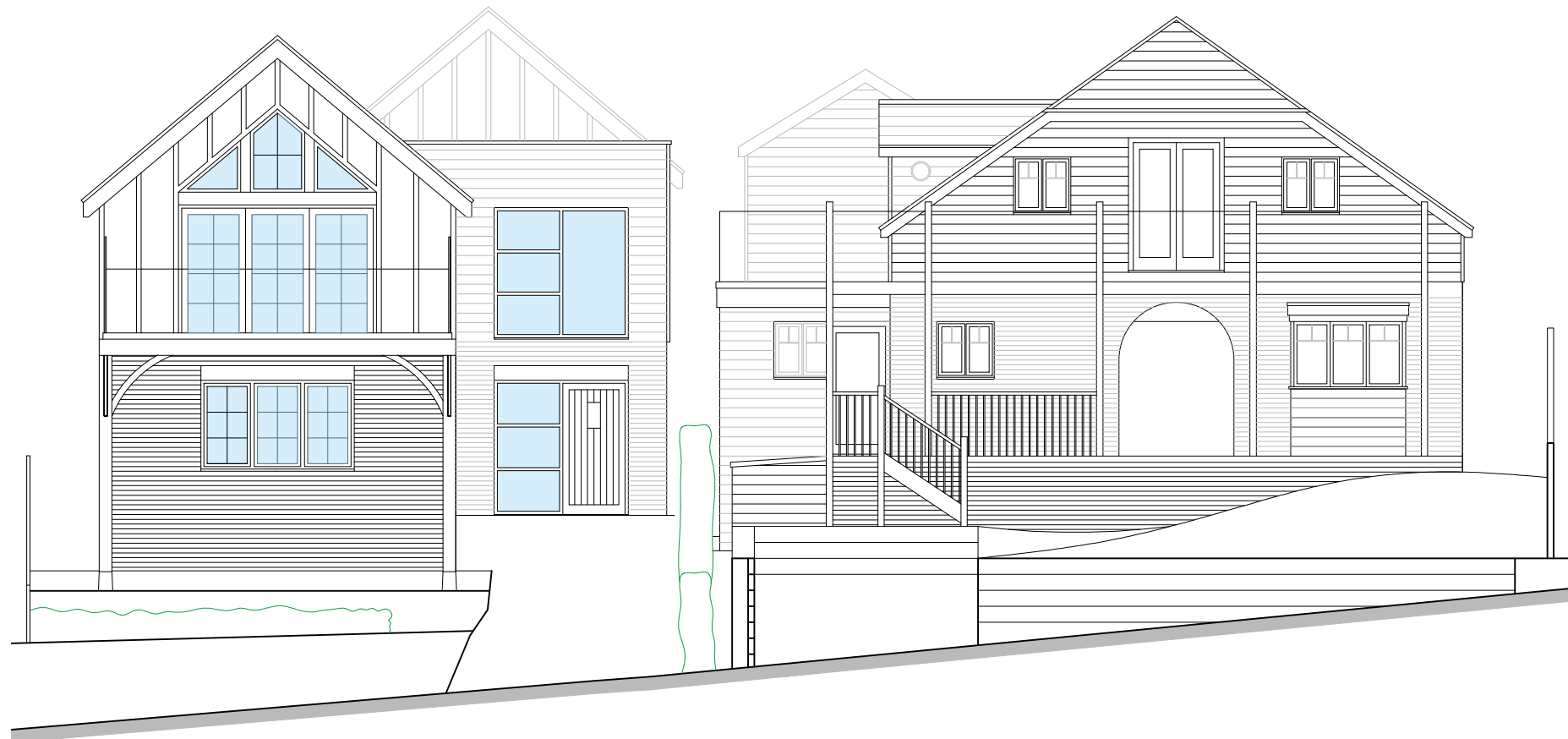
Proposed Street Scene