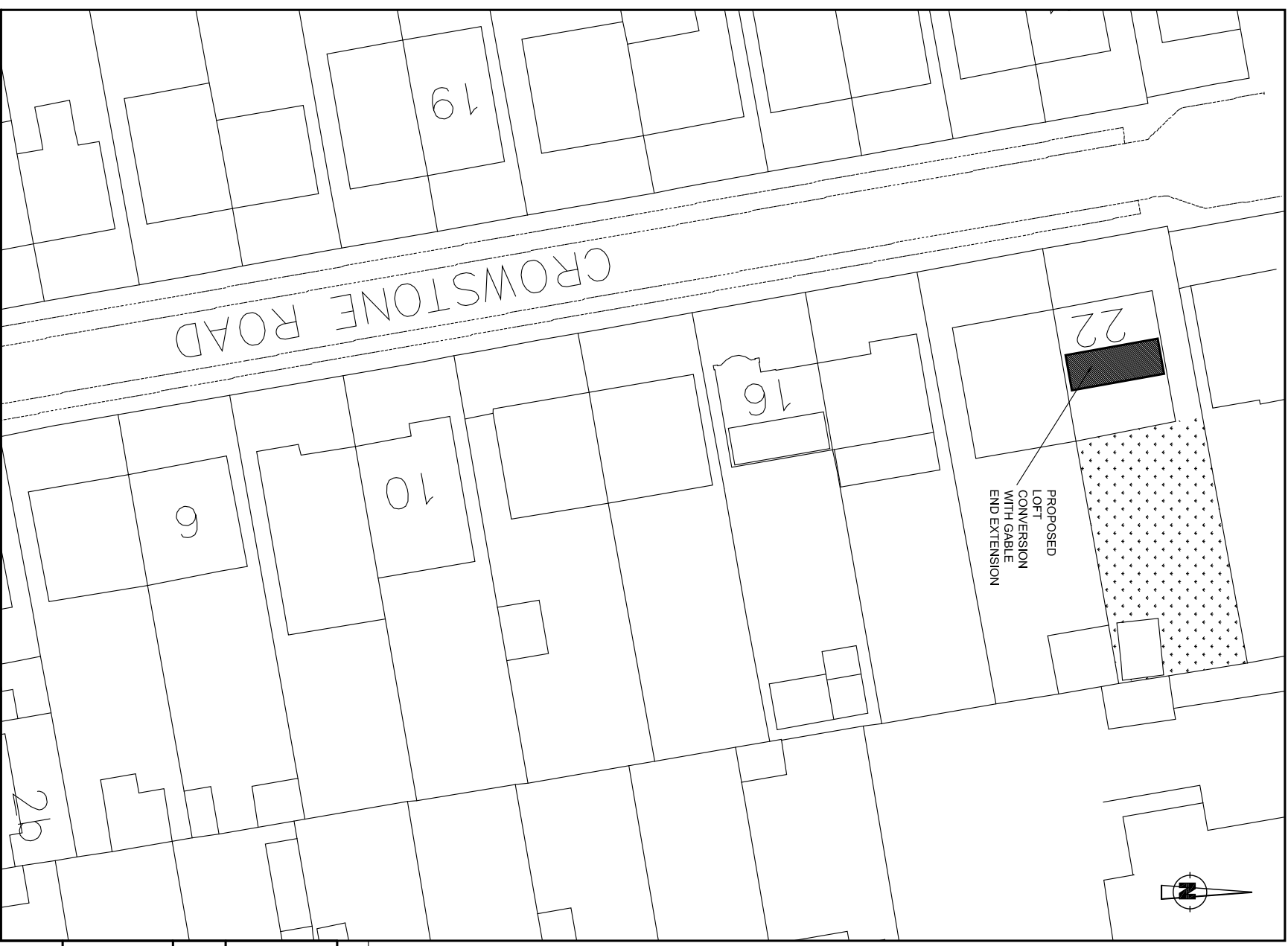
BLOCK PLAN 1:500 0 10 50 Meter