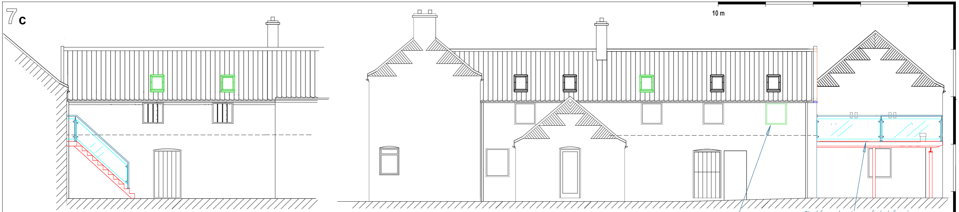
WEST ELEVATION (WITHIN YARD)