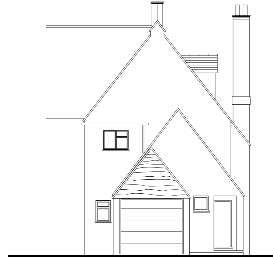
2 02 EXISTING SIDE ELEVATION SCALE 1:100 @A3