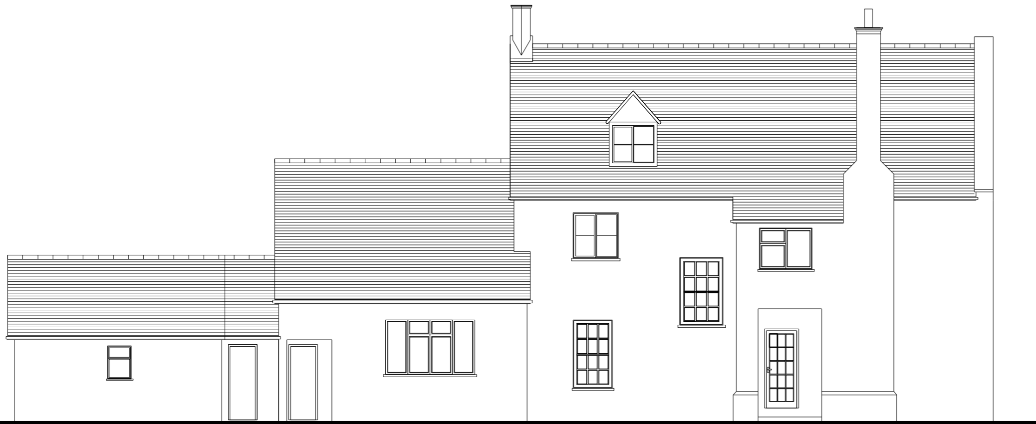
1 02 EXISTING FRONT ELEVATION SCALE 1:100 @A3