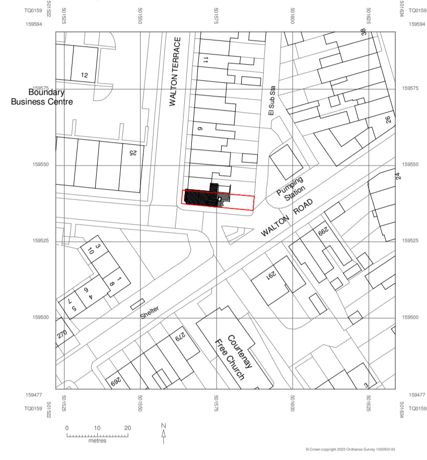
2 Proposed Location plan 1 : 1250