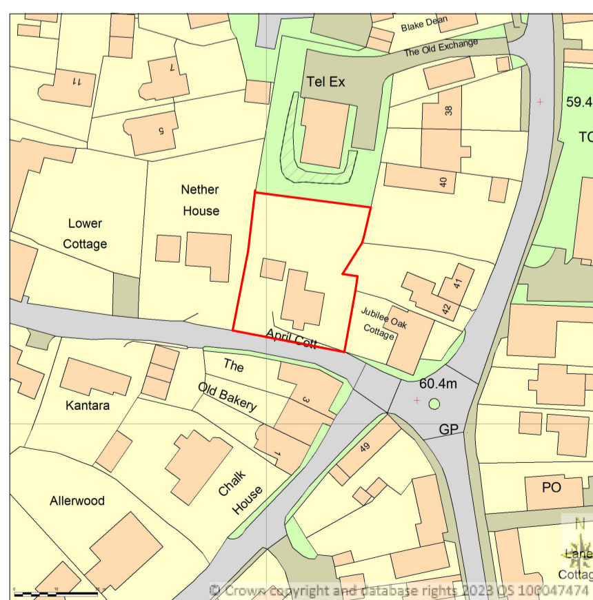
SITE LOCATION PLAN 1.1250