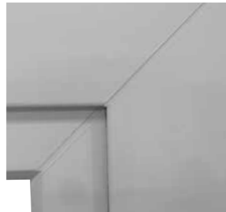
Windows with welded corners (above) are not usually allowed in conservation areas whereas windows with mechanical joints (below) have been approved.