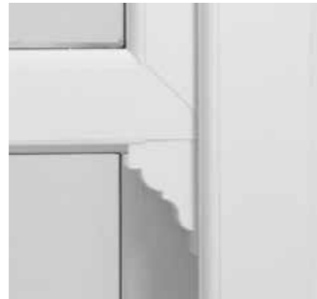
Windows with clip on sash horns (above) are not usually allowed in conservation areas whereas windows with run-through sash horns (below) have been approved.