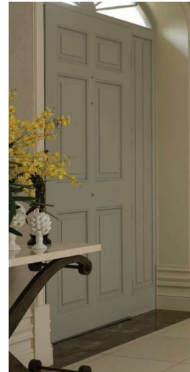
Door Style – Similar to properties on sandy lodge road, moor park estate.