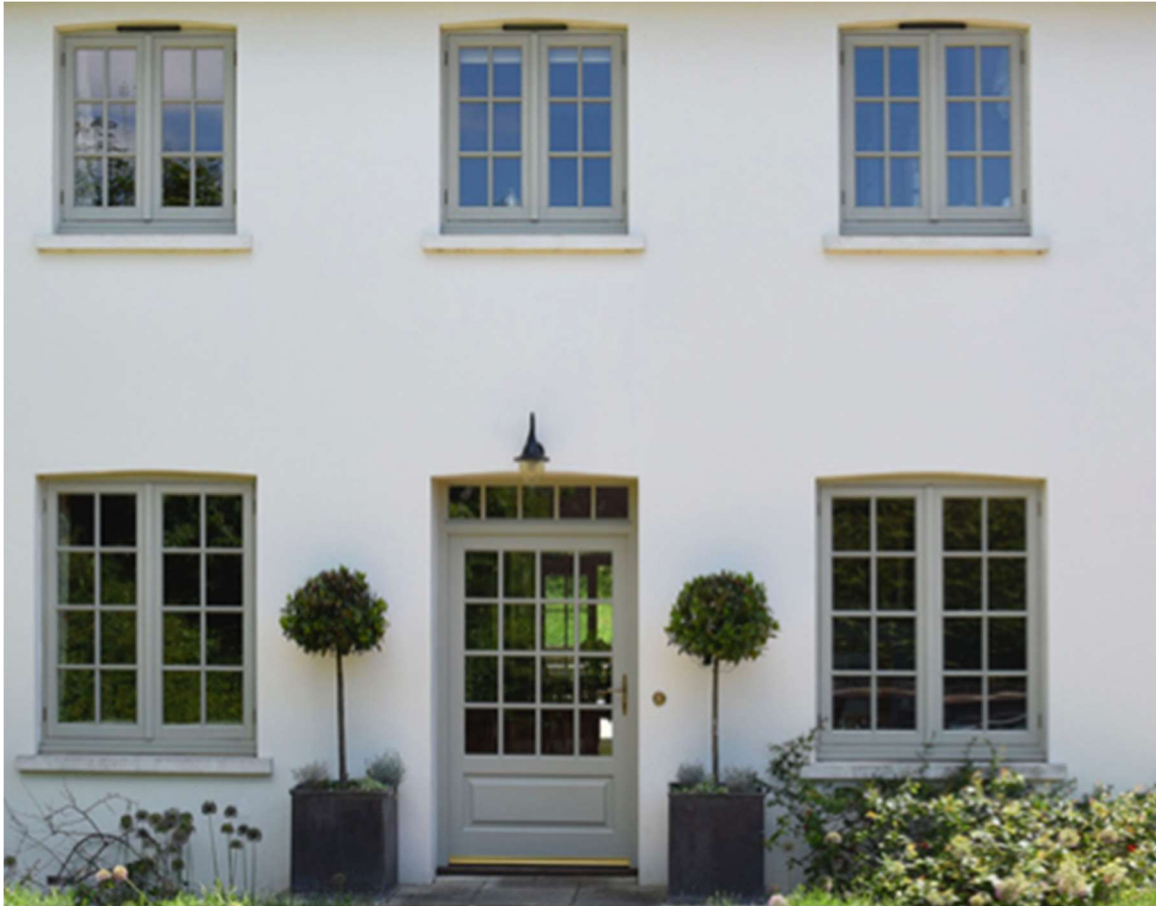
White Render with RAL 7032 timber windows showing stone sills.