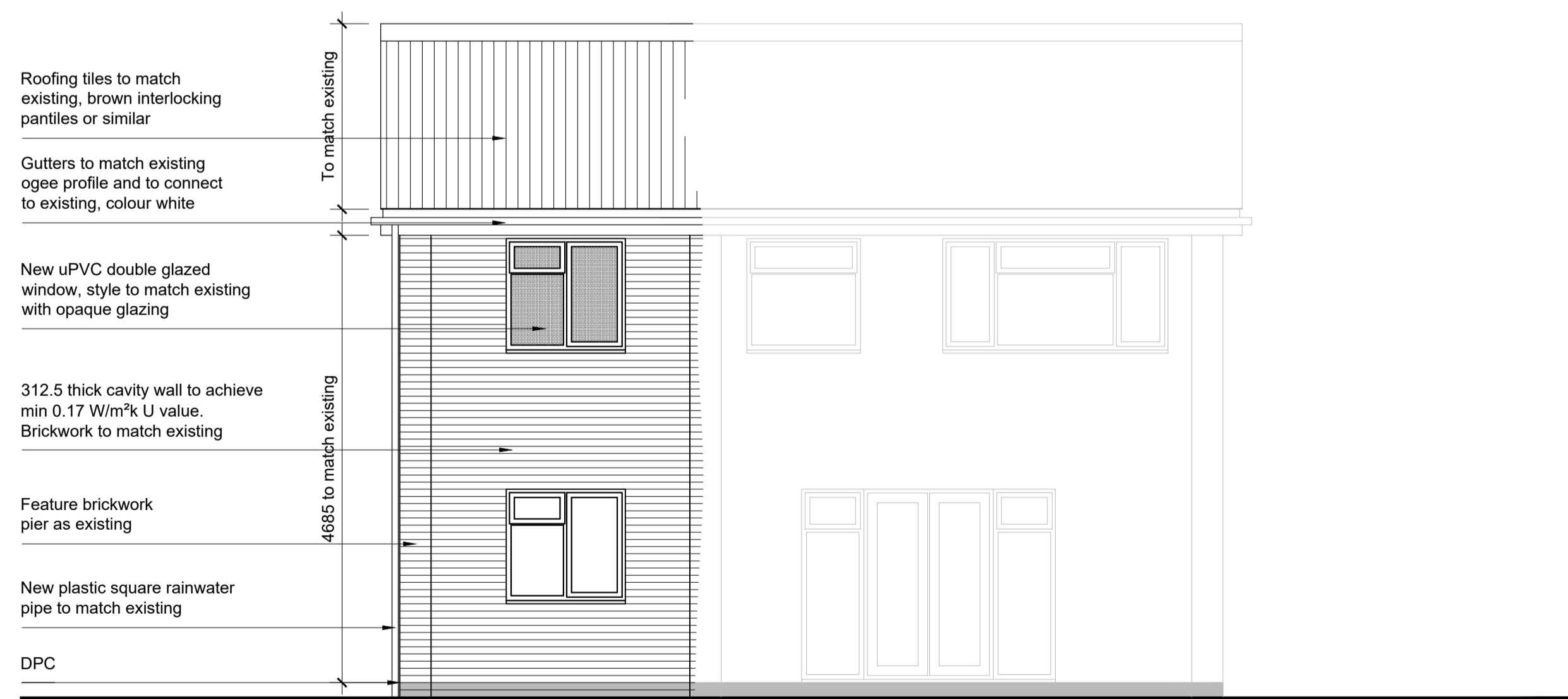
REAR ELEVATION 1:50