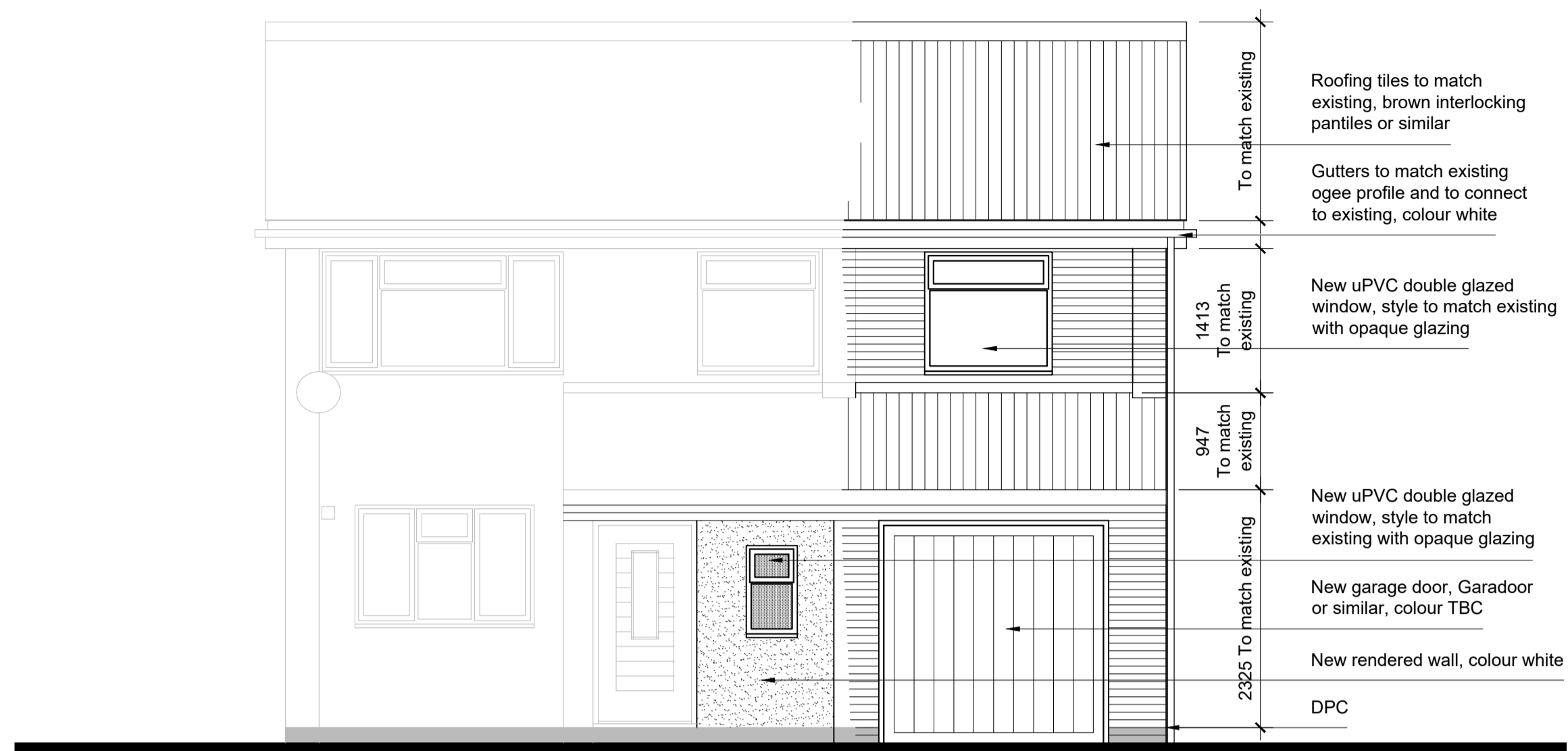
FRONT ELEVATION 1:50