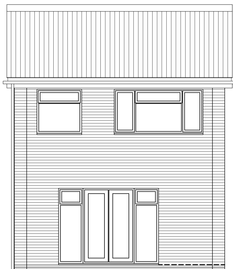
REAR ELEVATION 1:50