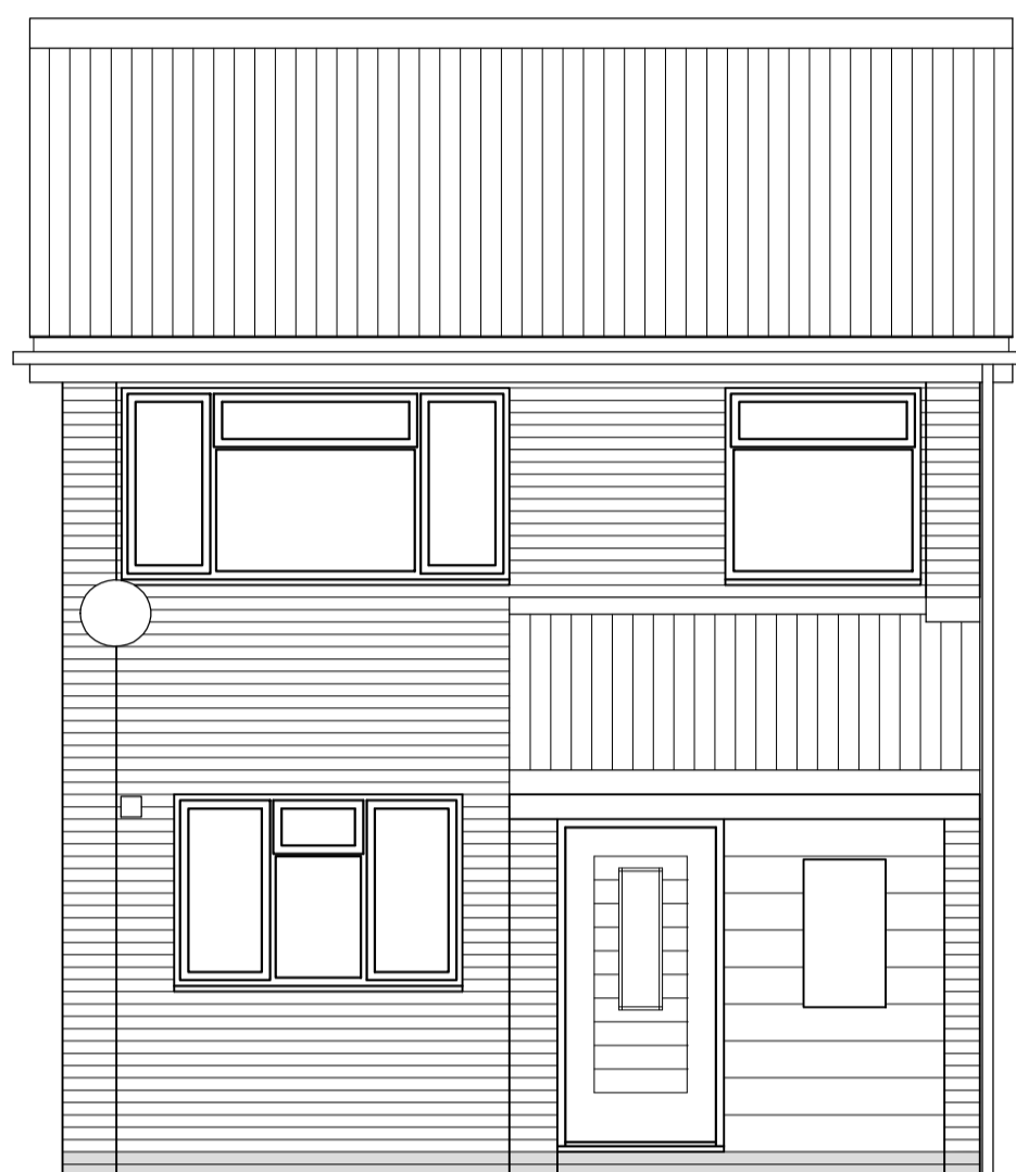
FRONT ELEVATION 1:50