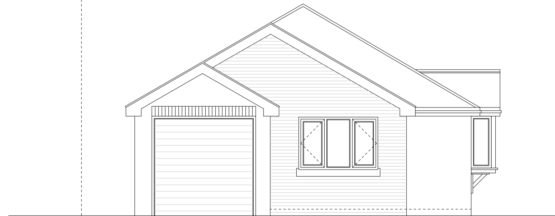
PROPOSED SIDE ELEVATION Scale 1:50