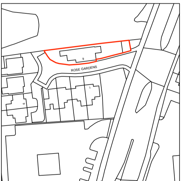
OS MAP Scale 1:1250