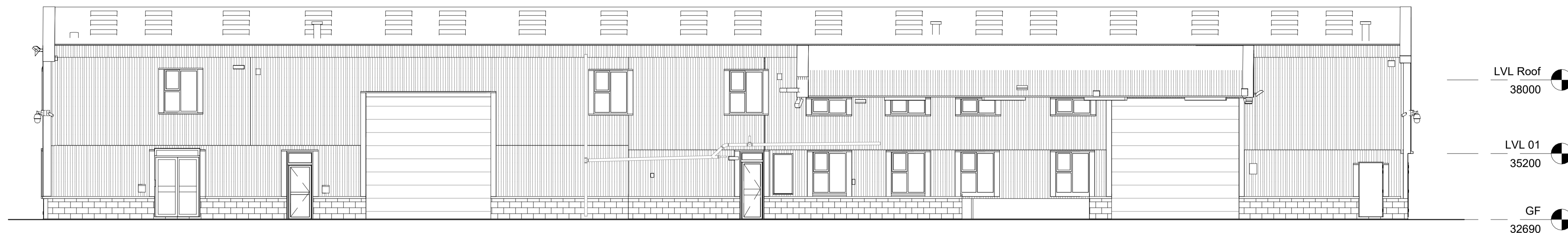
1 East Elevation Existing 1 : 100