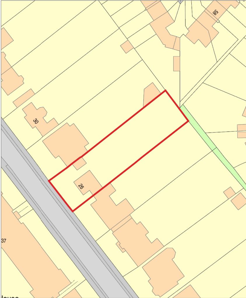
Existing Site Plan Scale: 1/500