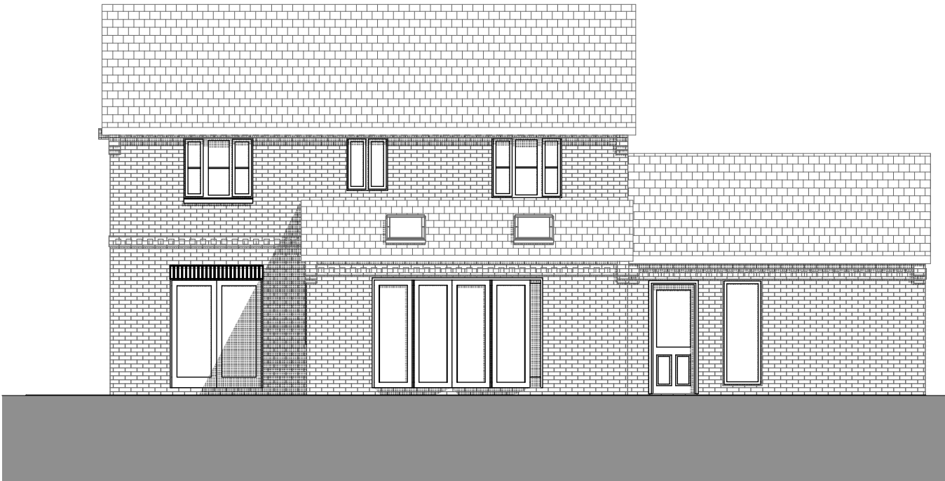
2 Rear Elevation 1:100