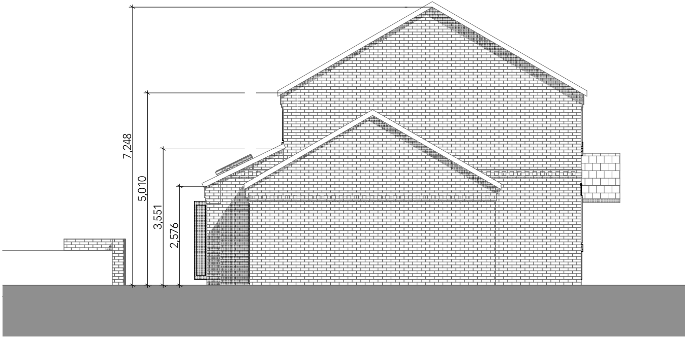
4 Side Elevation Two 1:100