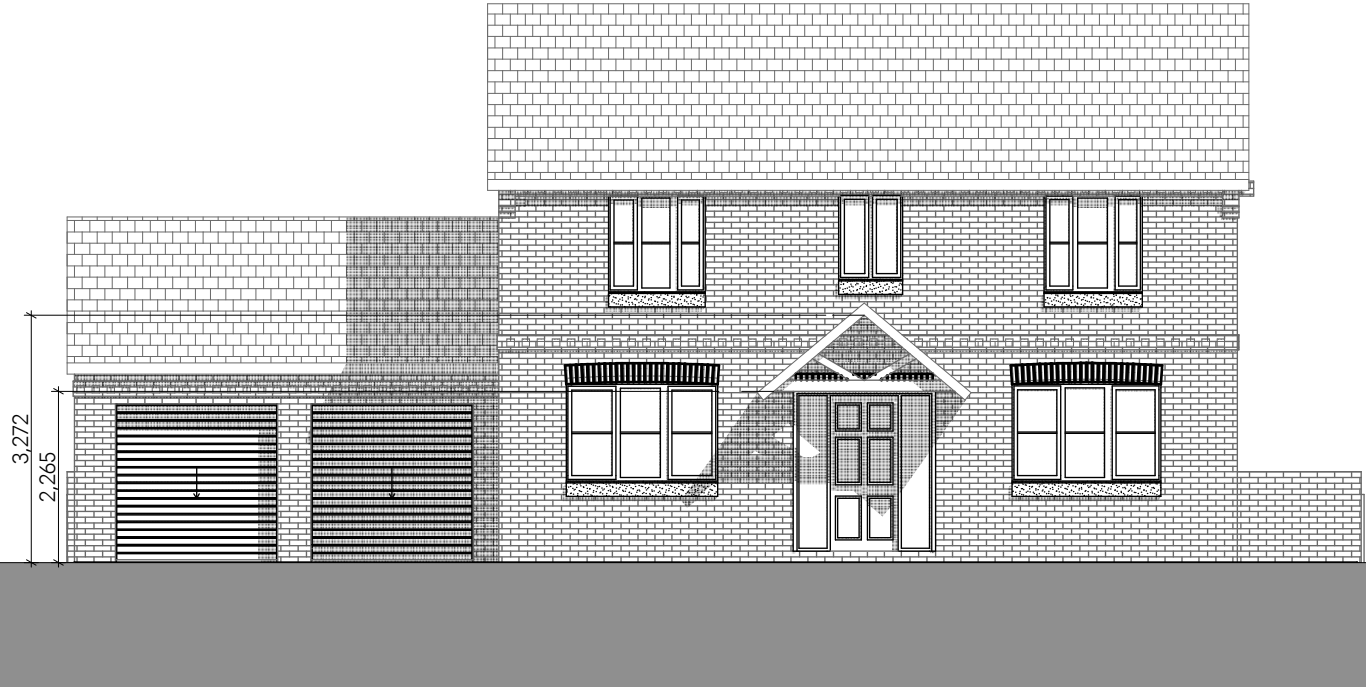
1 Front Elevation 1:100