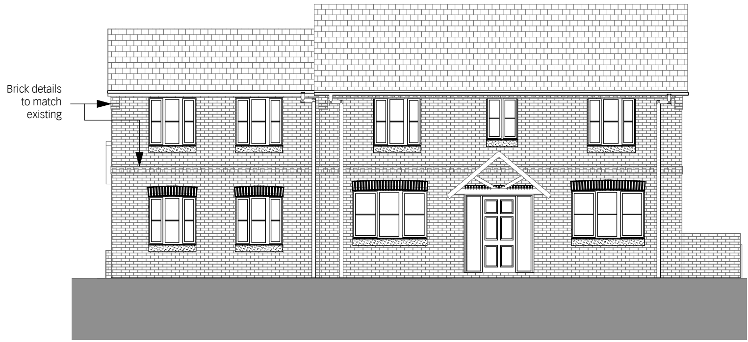
1 Front Elevation 1:100