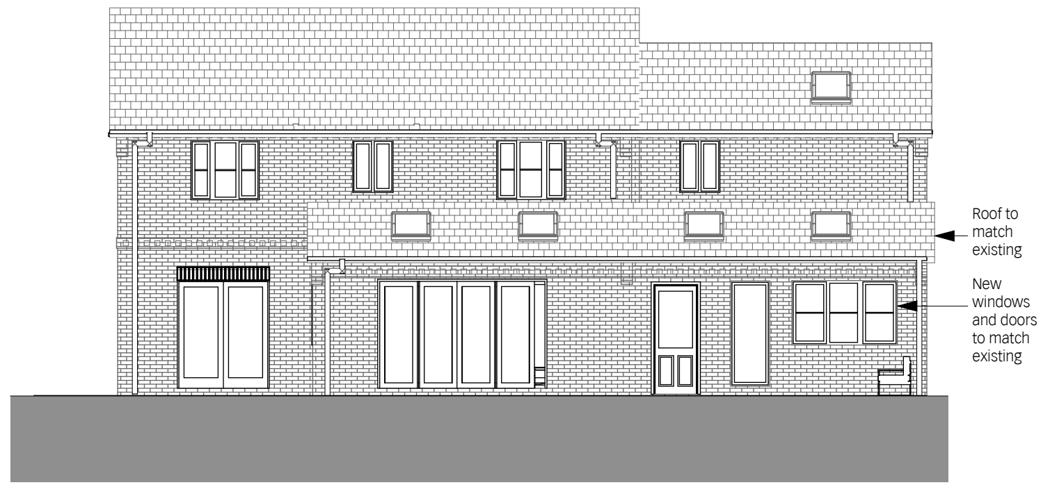
2 Rear Elevation 1:100