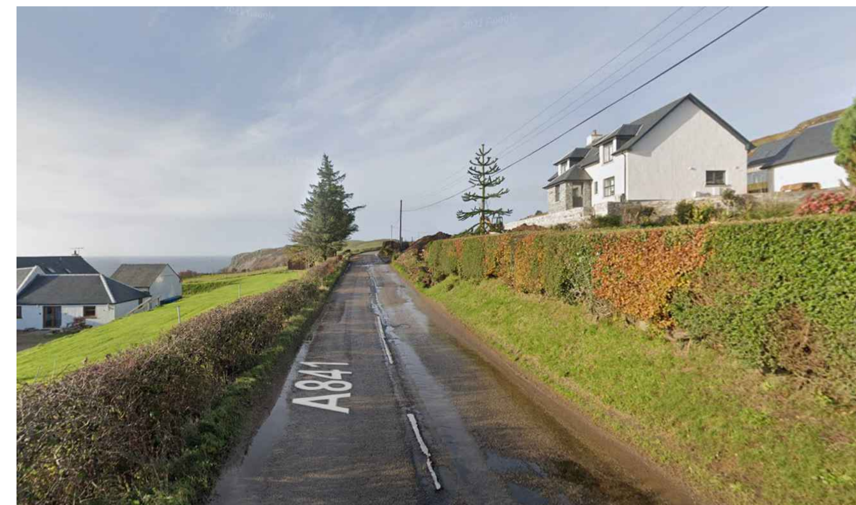
View 3. Facing west on A841 from existing site entrance.