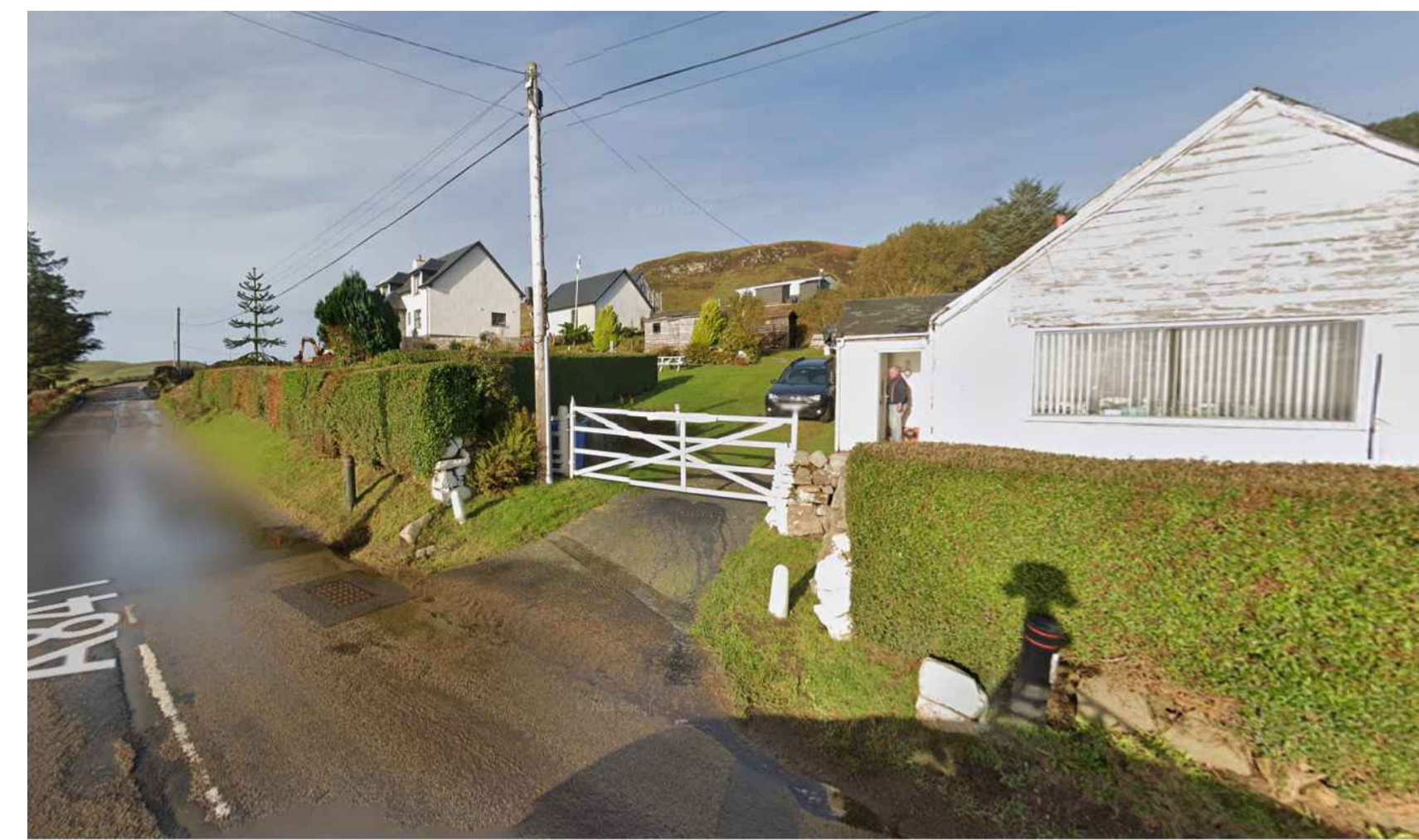
View 1. Existing gated site access onto A841.