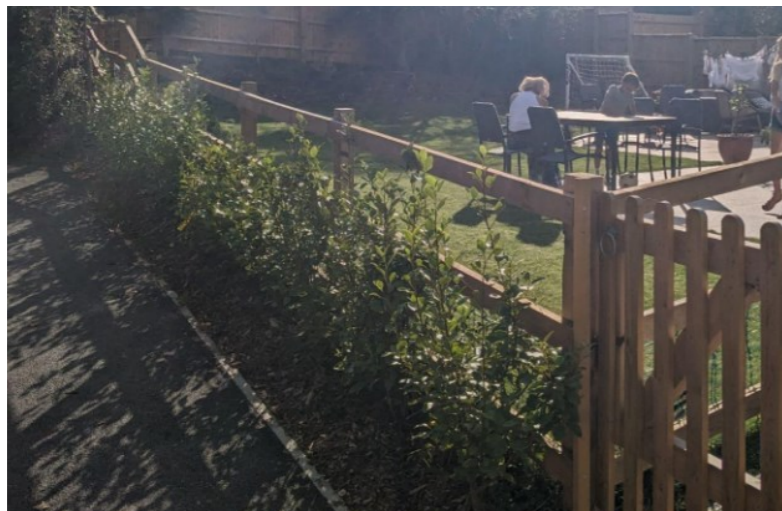
Existing fence on eastern boundary