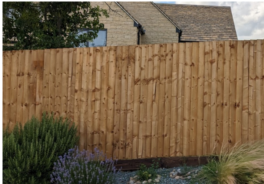
Photograph example of proposed fence (existing fence on southern boundary)