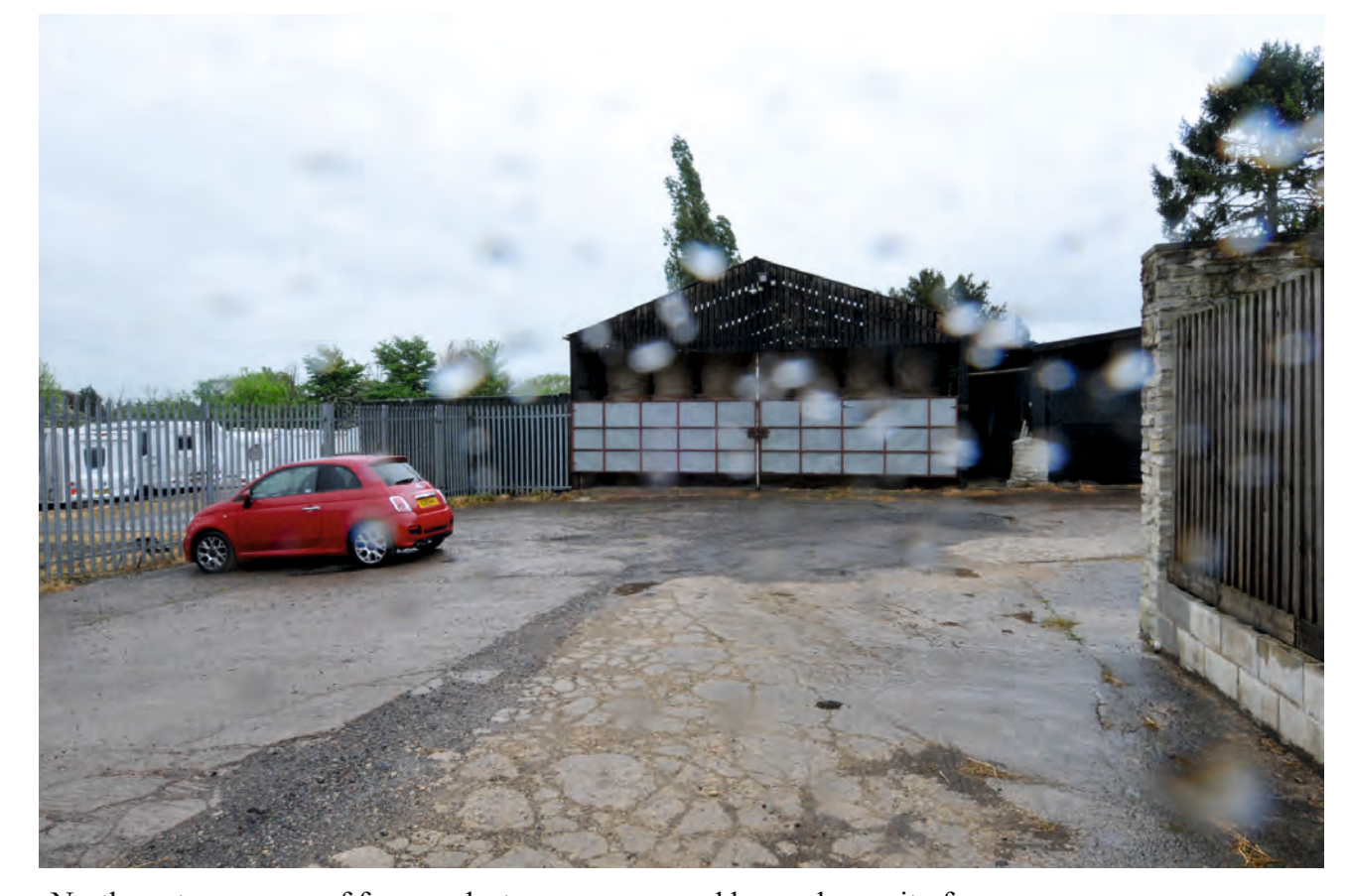
North-eastern corner of farmyard, storage compound beyond security fence