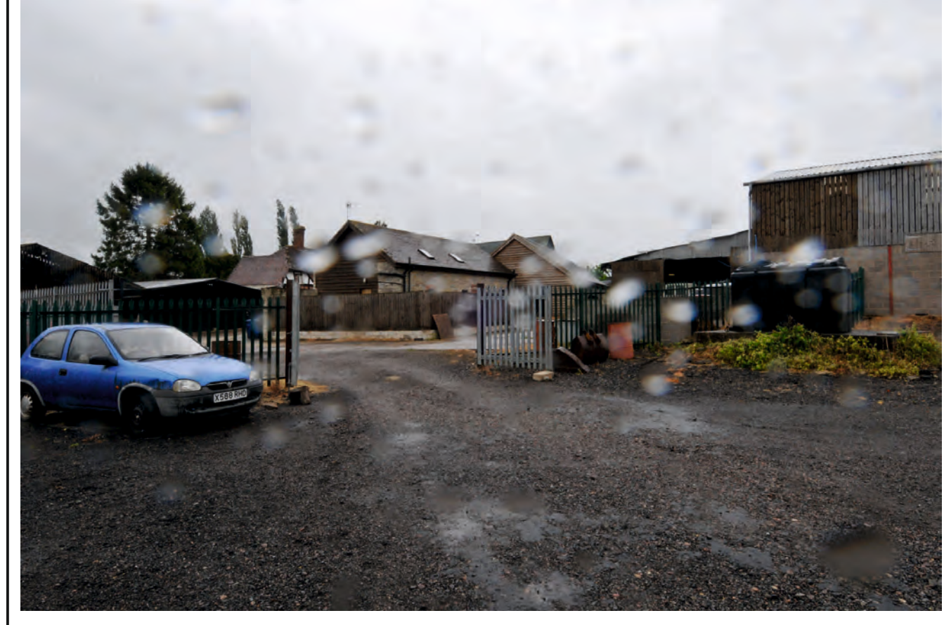
Facing south east towards farmyard from compound entrance