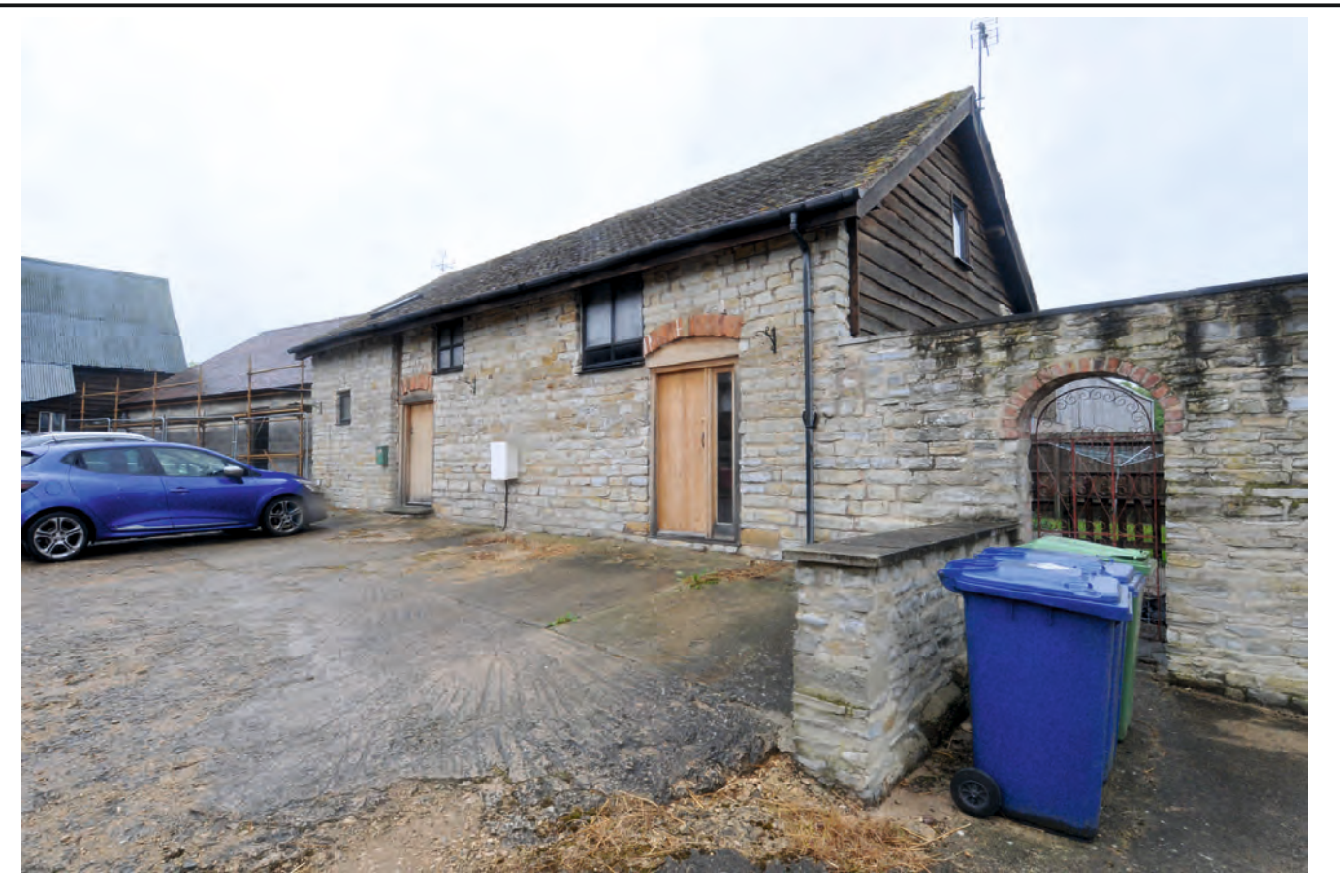
Converted student accomodation block