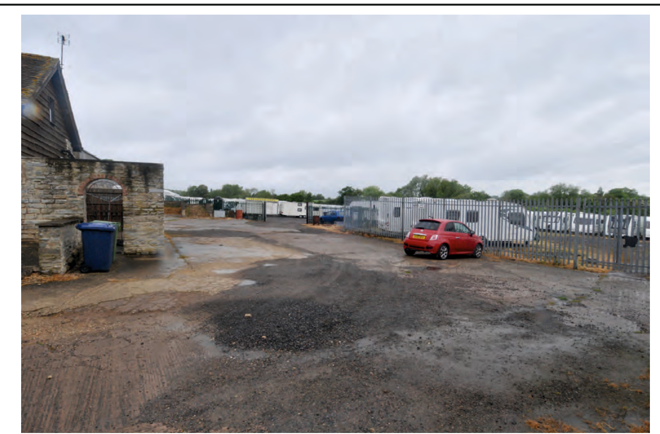
View facing NW from Point O