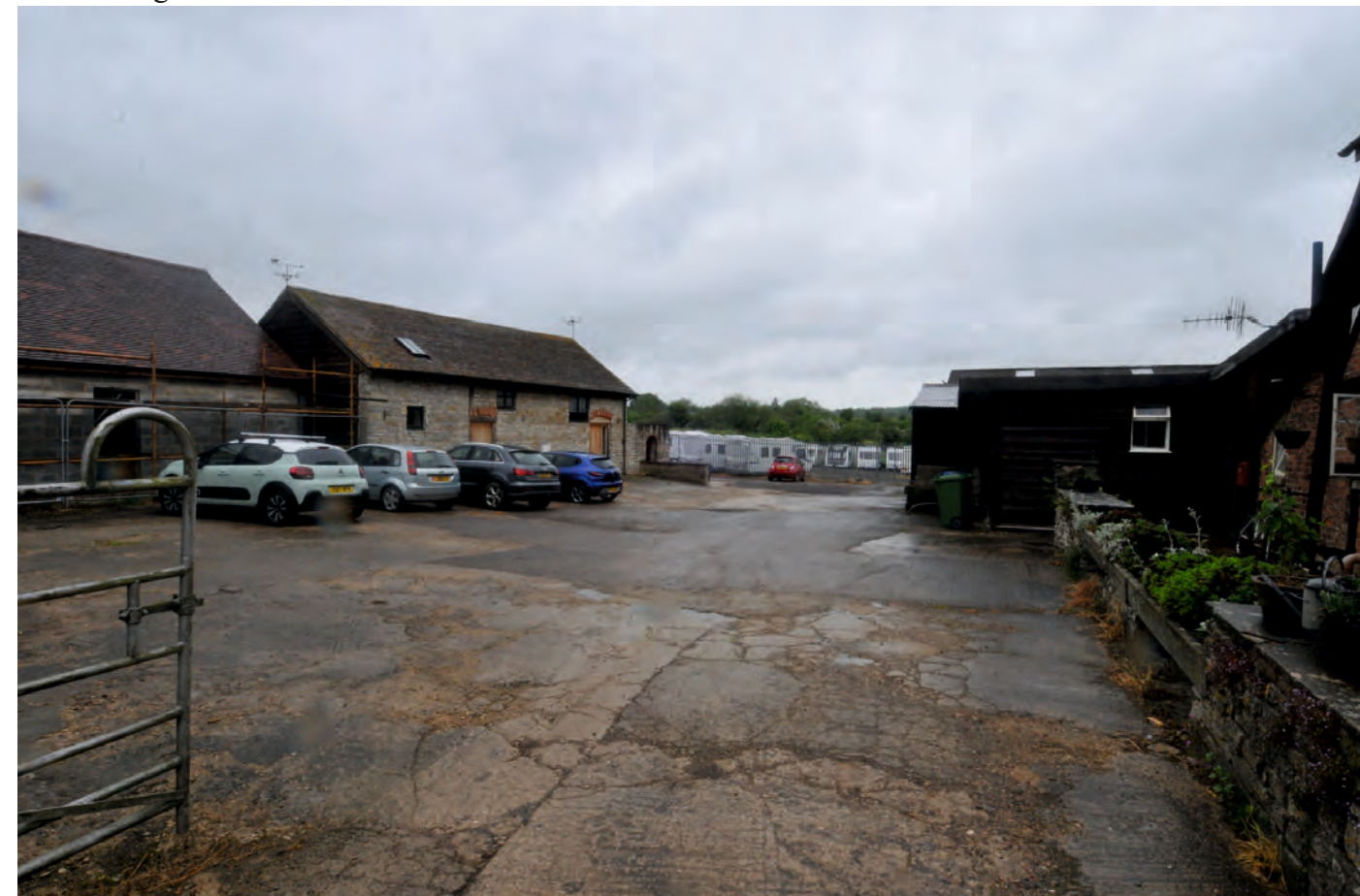
View facing NE from Point M