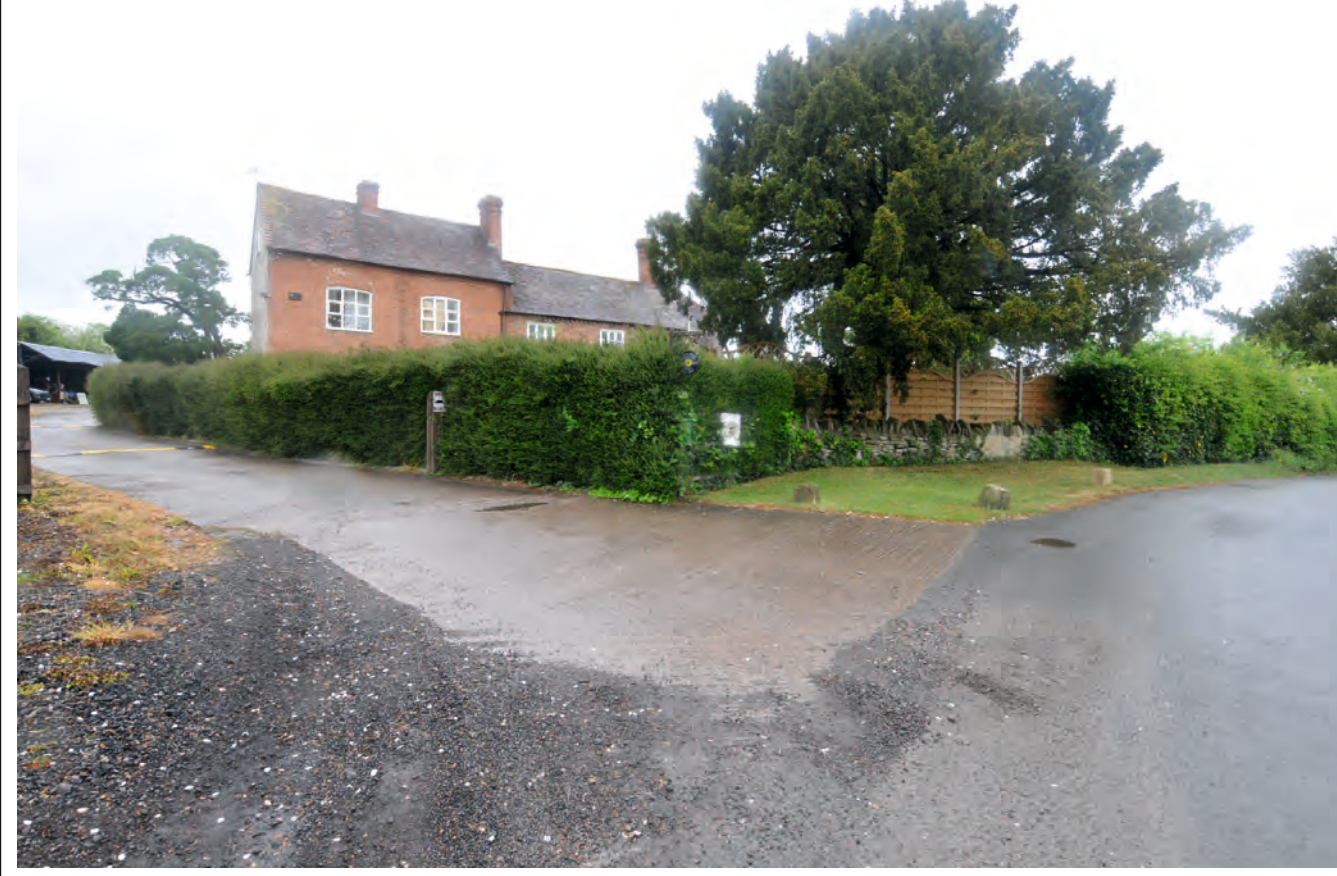
View facing NE from Point L (storage area visible beyond red car)