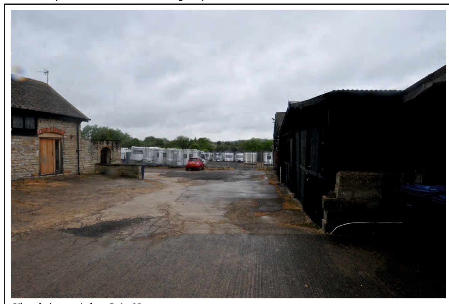
View facing north from Point N