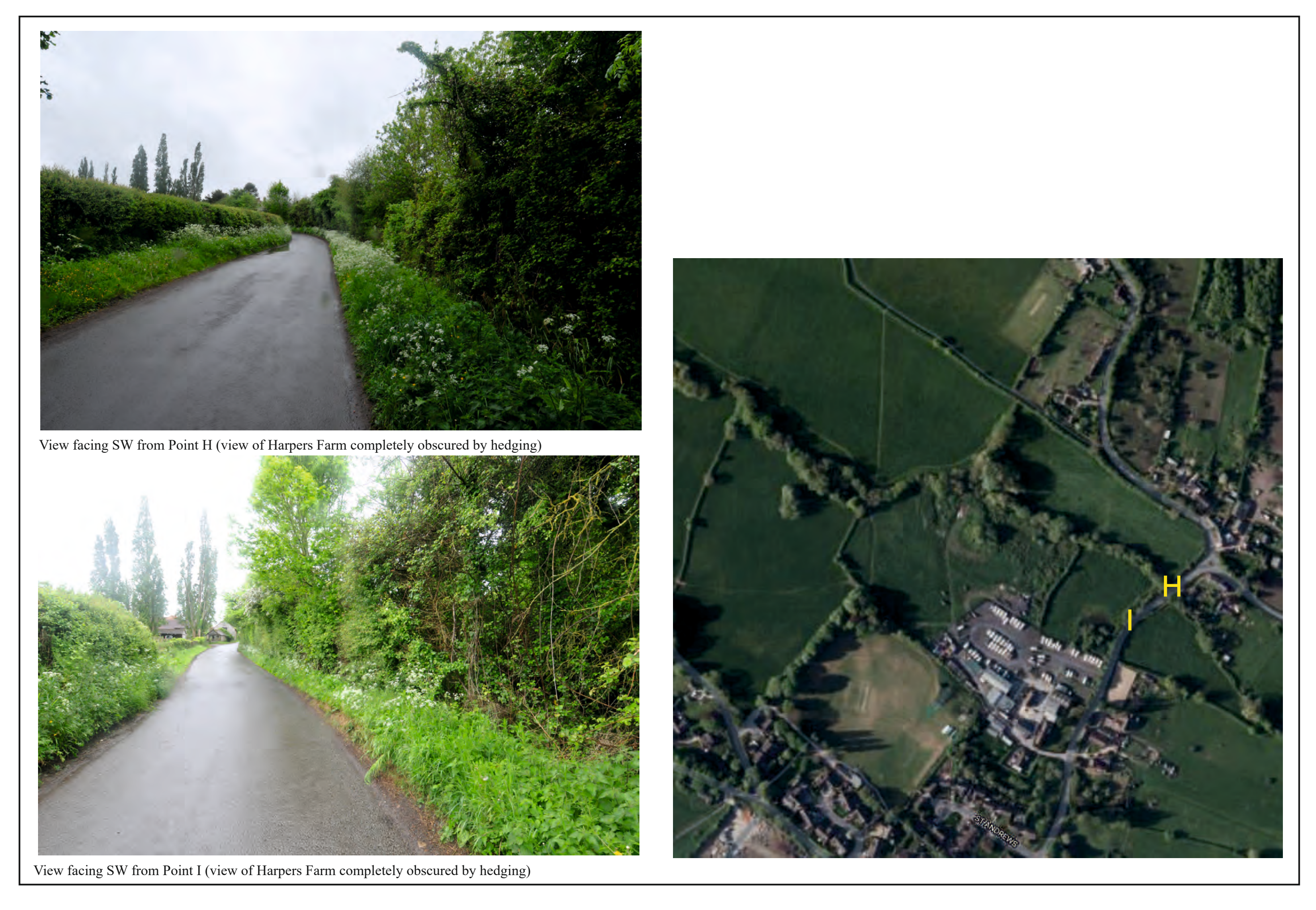
Figure 14: Boundary between Harpers Farm and The Stream