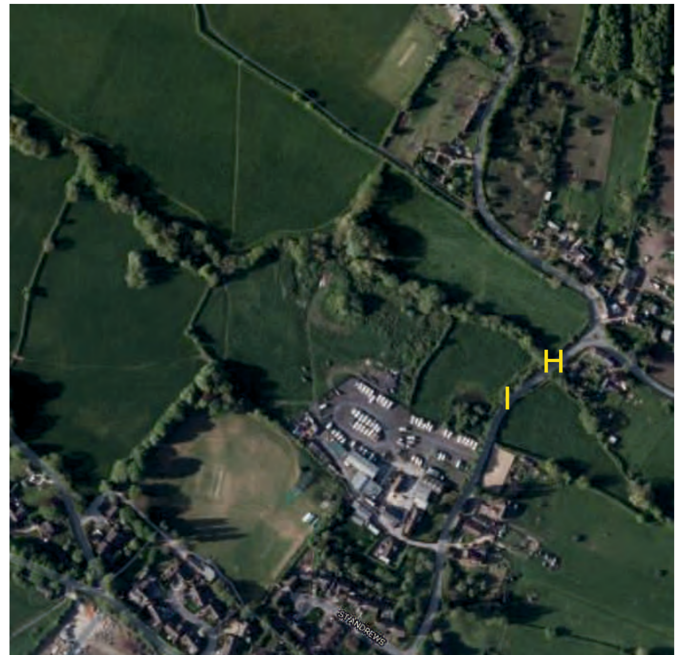
Figure 14: Boundary between Harpers Farm and The Stream