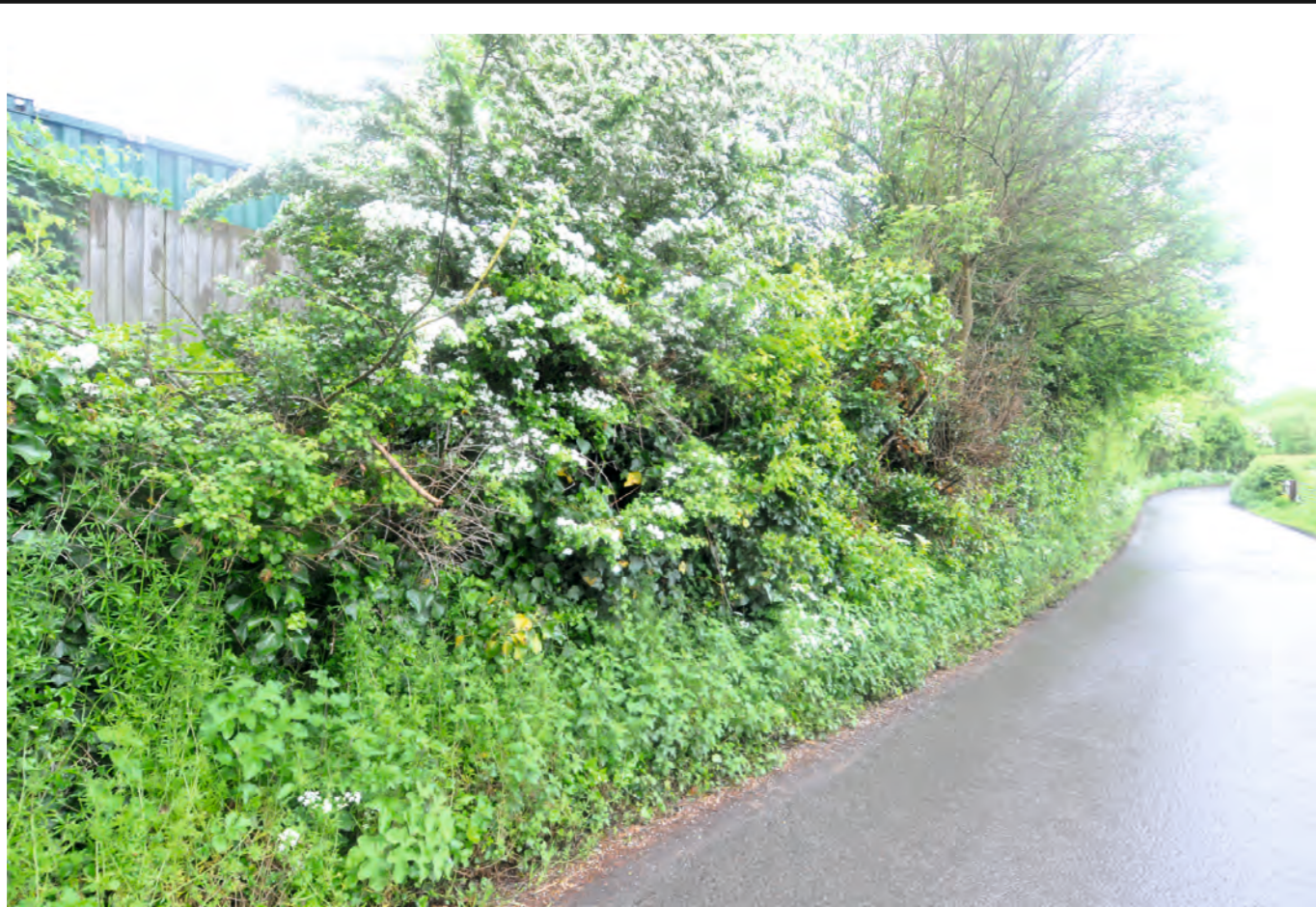
View facing North West from Point J