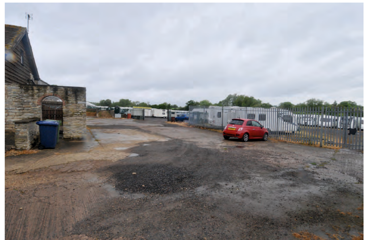
View facing NW from Point O