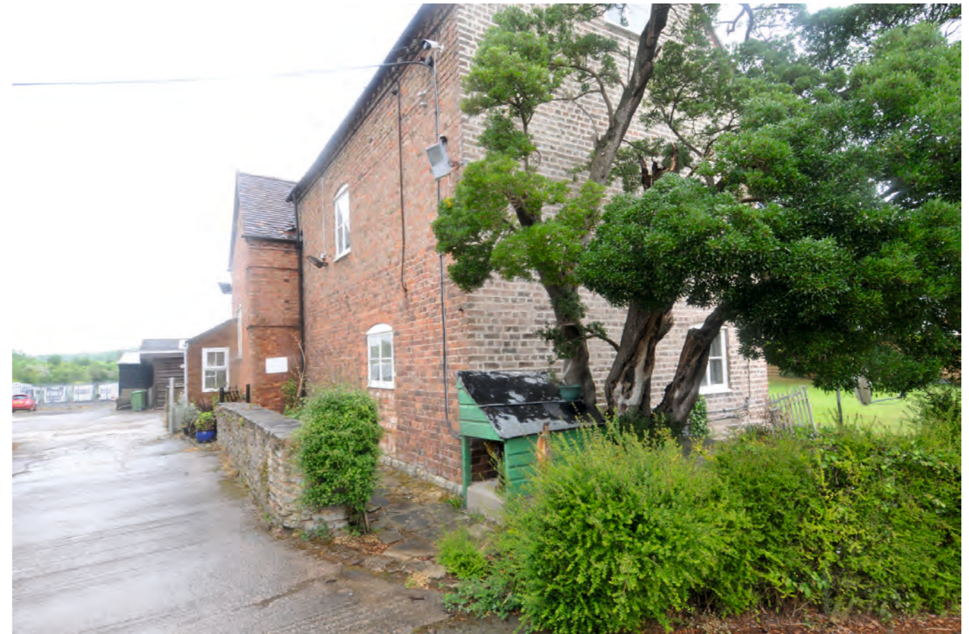
View facing NE from Point L (storage area visible beyond red car)