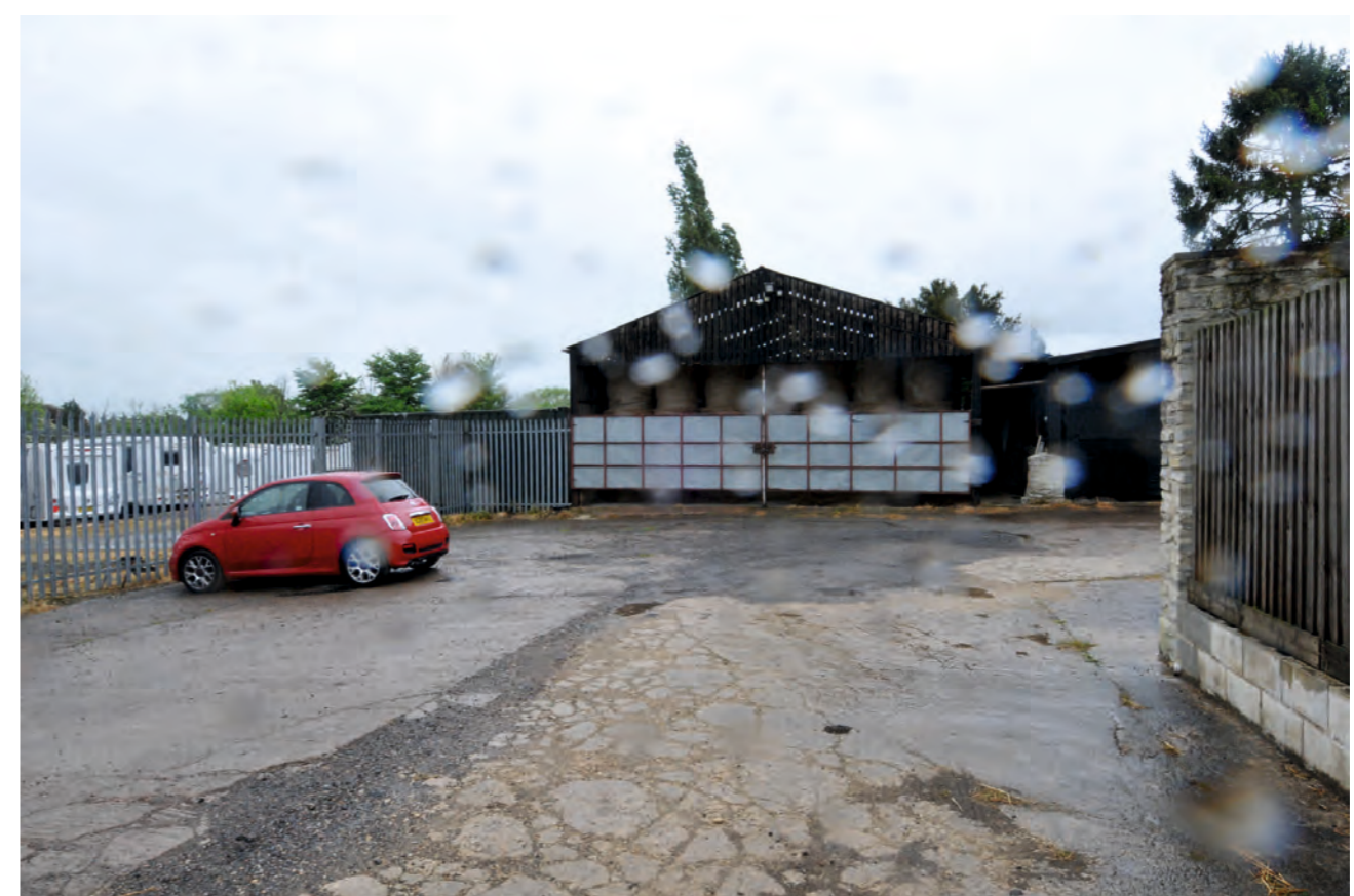
North-eastern corner of farmyard, storage compound beyond security fence