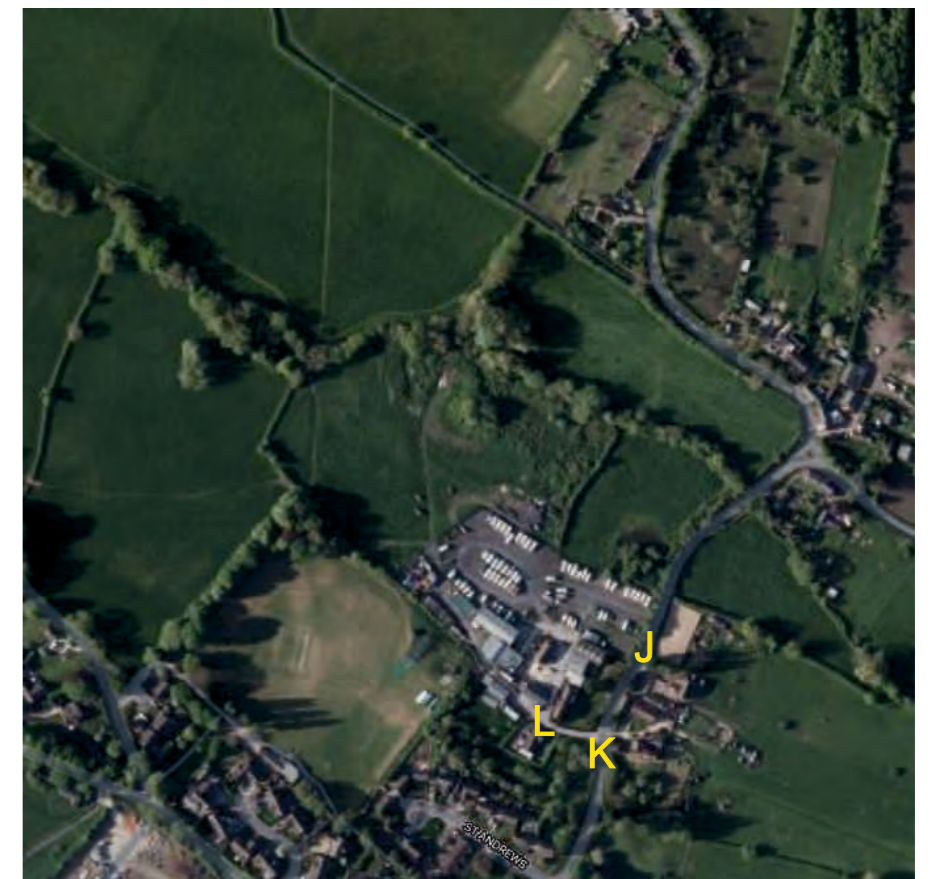
Figure 15: Approaches to Harper's Farm