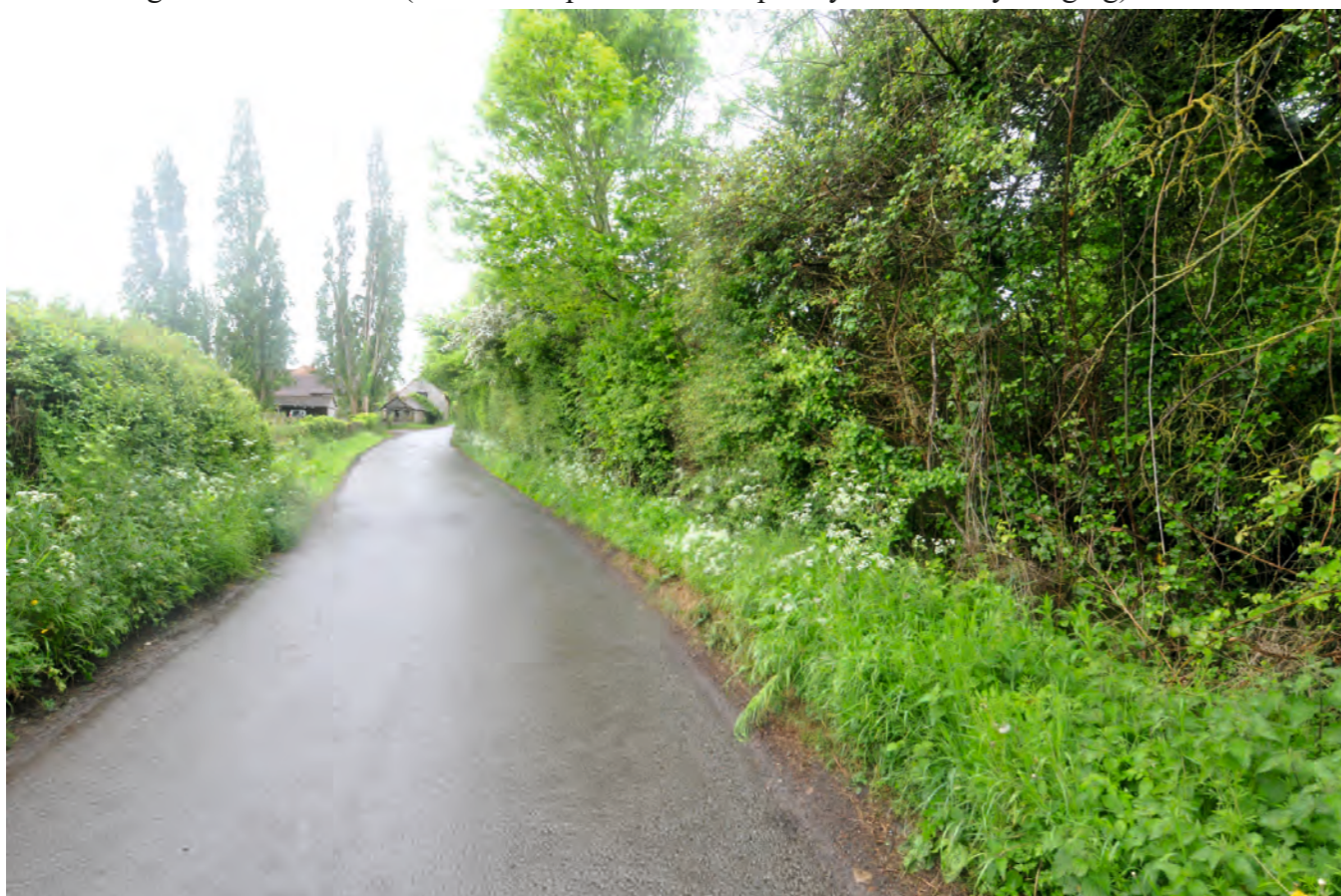
View facing SW from Point I (view of Harpers Farm completely obscured by hedging)