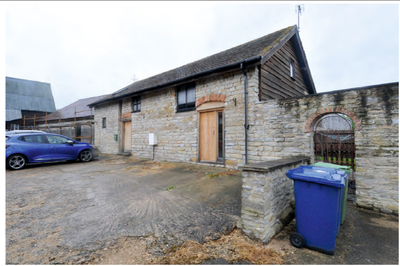
Converted student accommodation block