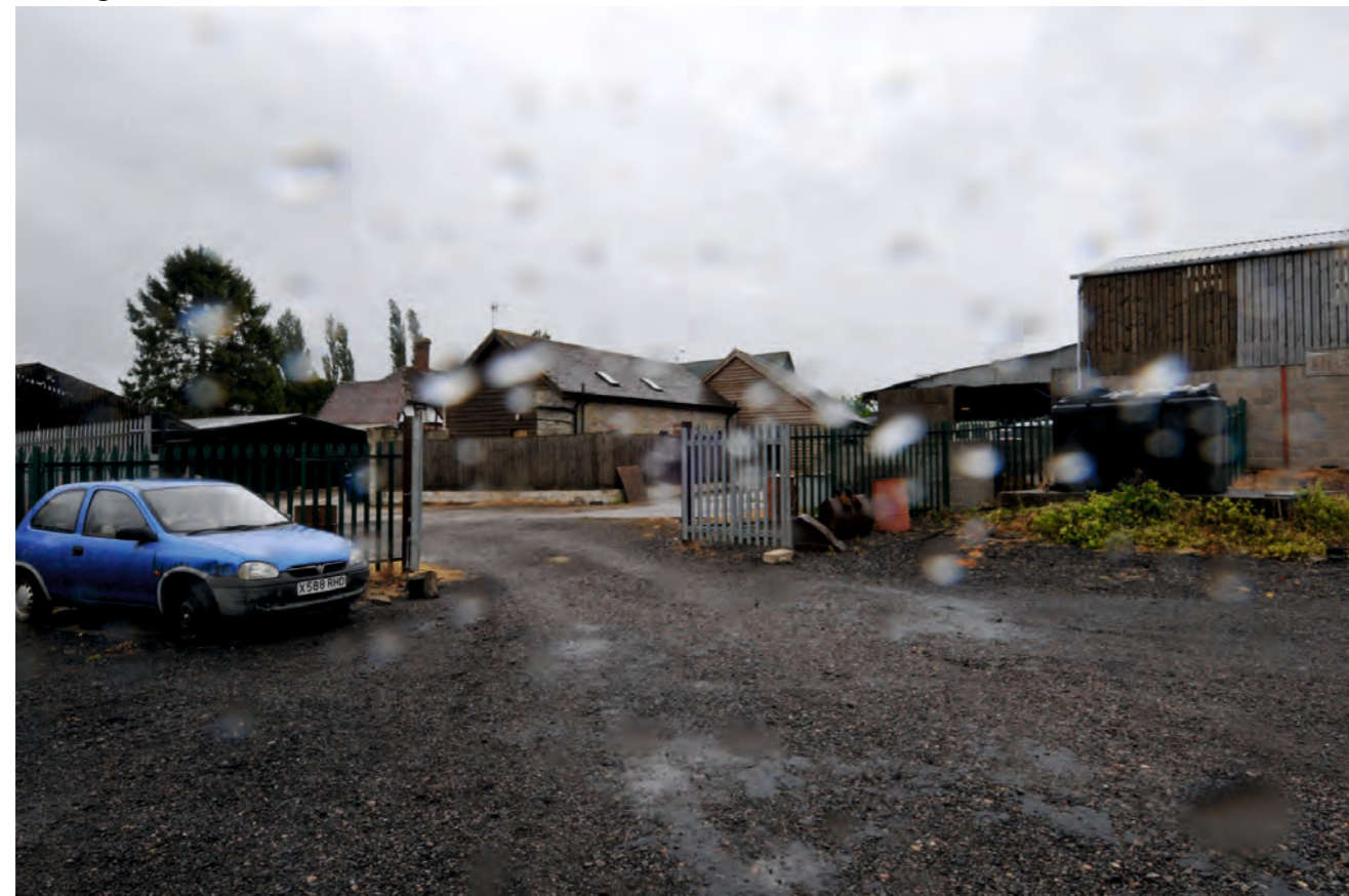
Facing south east towards farmyard from compound entrance