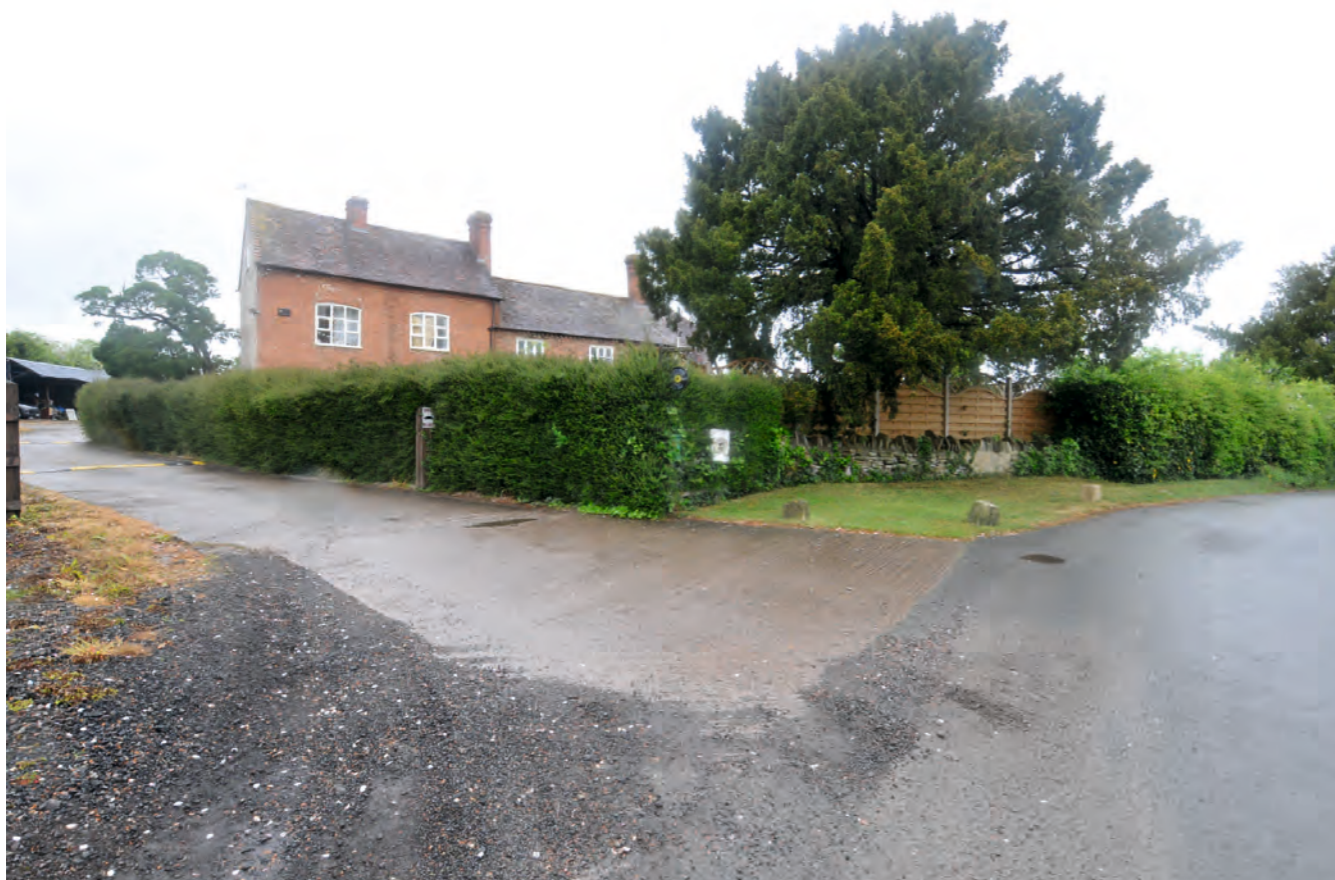
View facing N from Point K (site entrance)