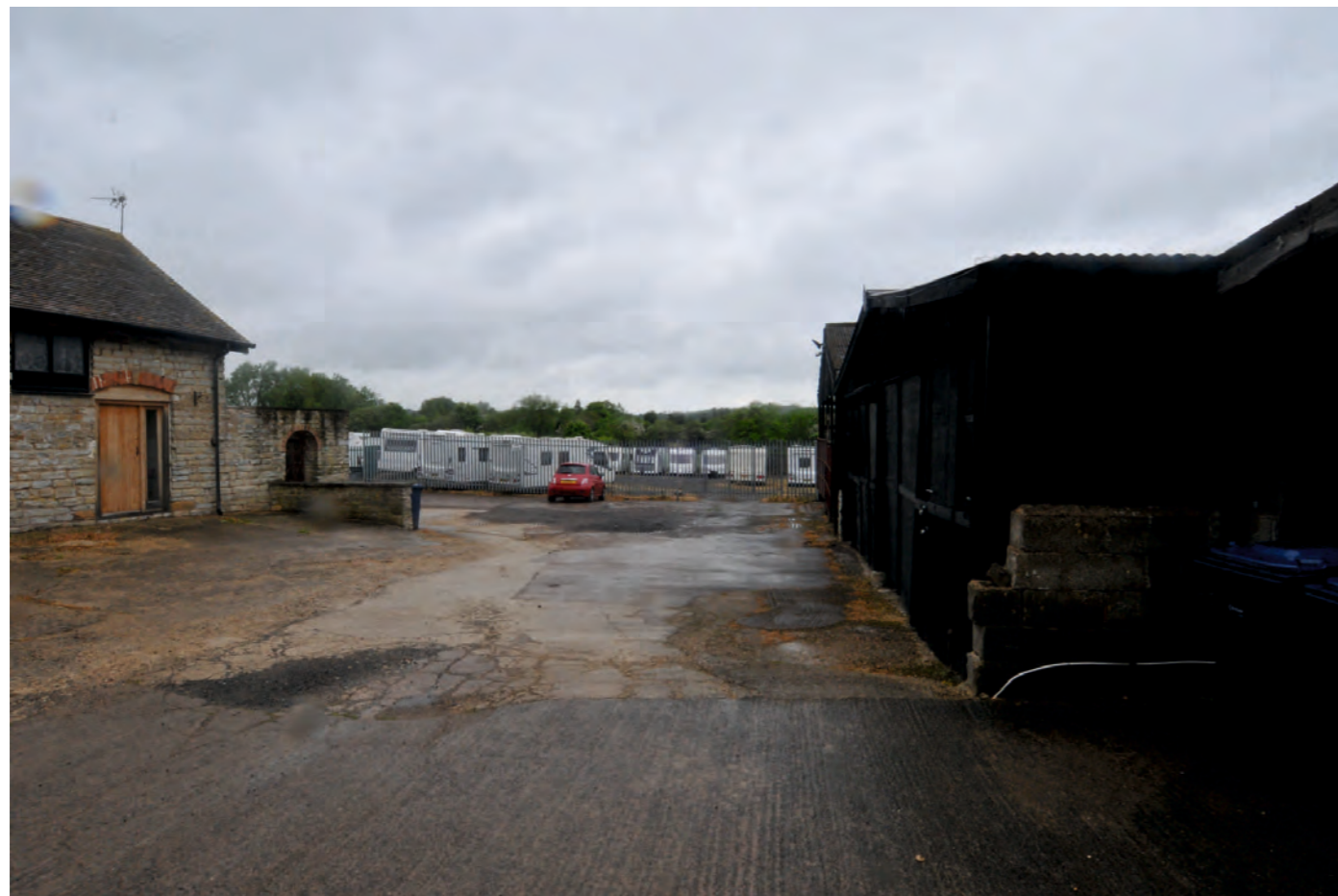
View facing north from Point N