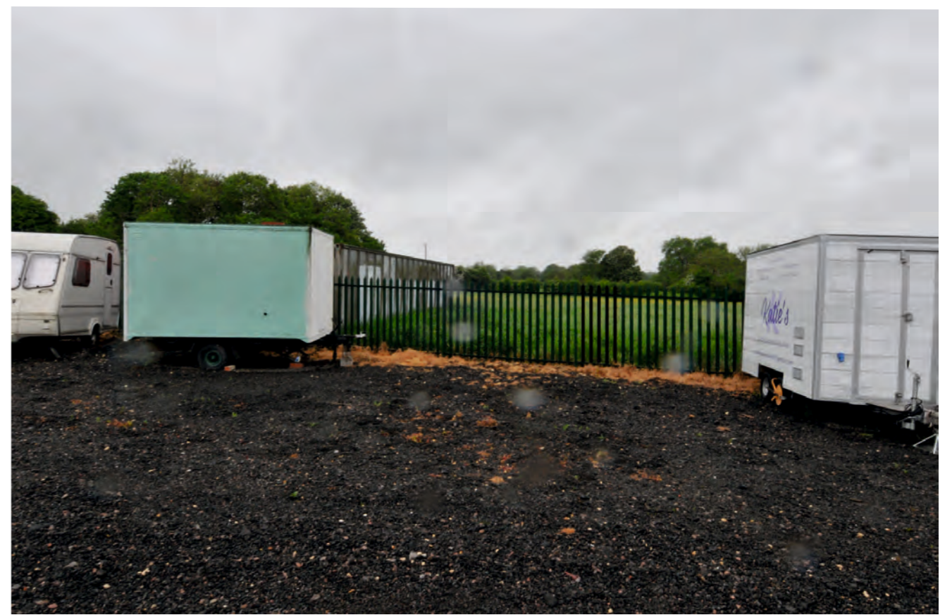
Figure 18: General views within existing storage compound