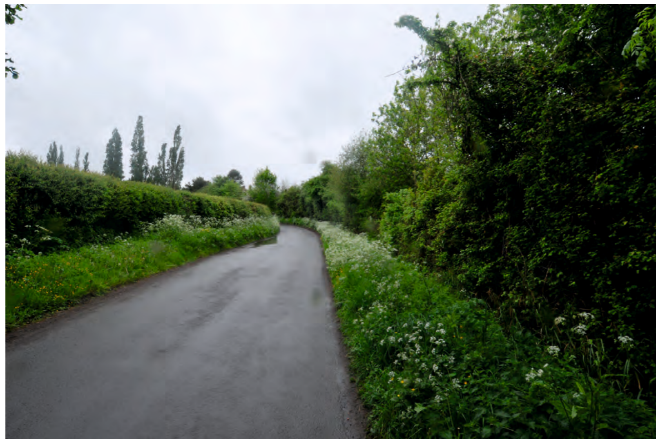
View facing SW from Point H (view of Harpers Farm completely obscured by hedging)