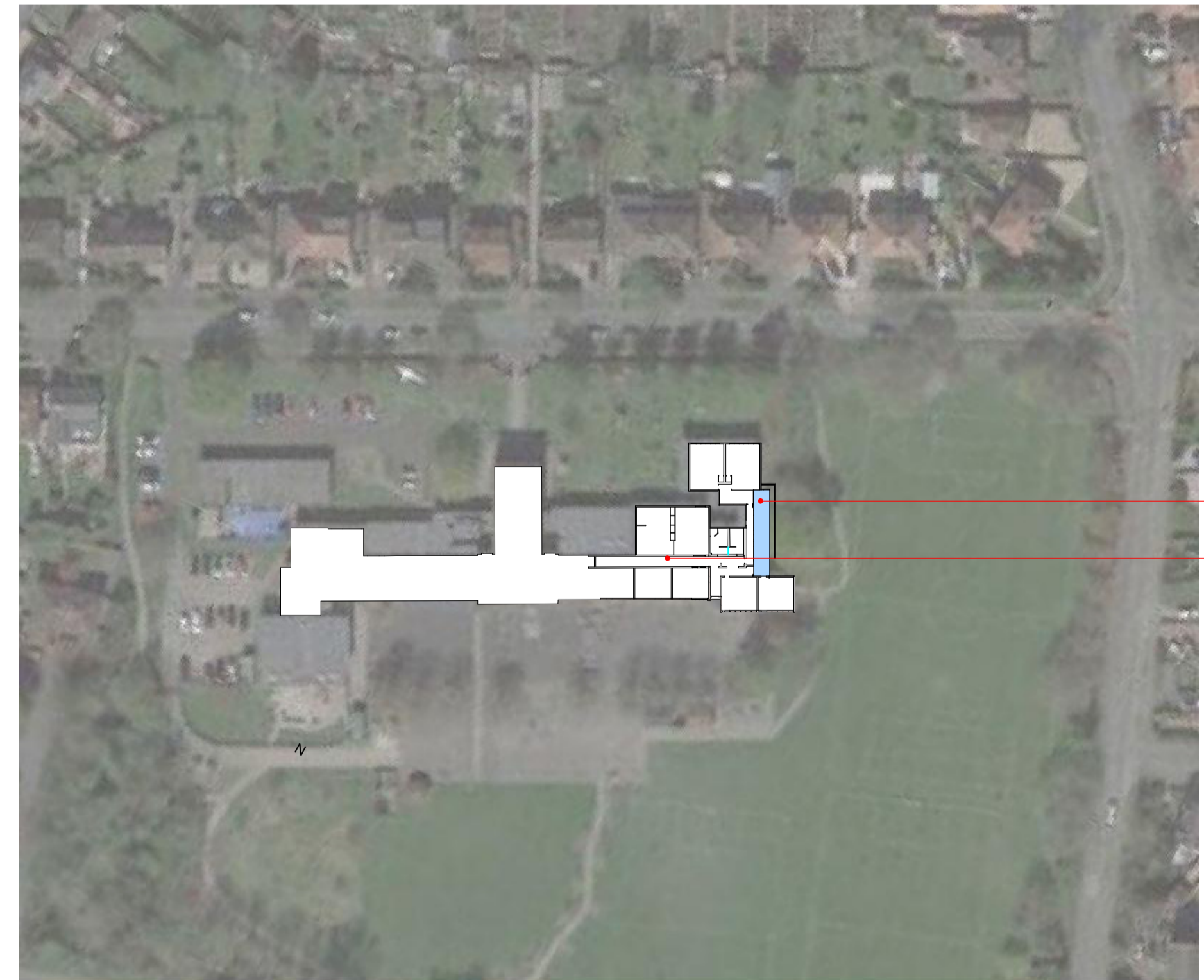
3 Site_Plan_Location 1:1000