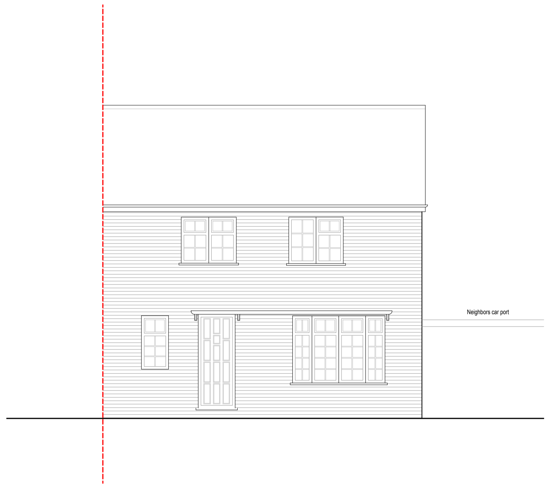
Existing South elevation Scale 1:50