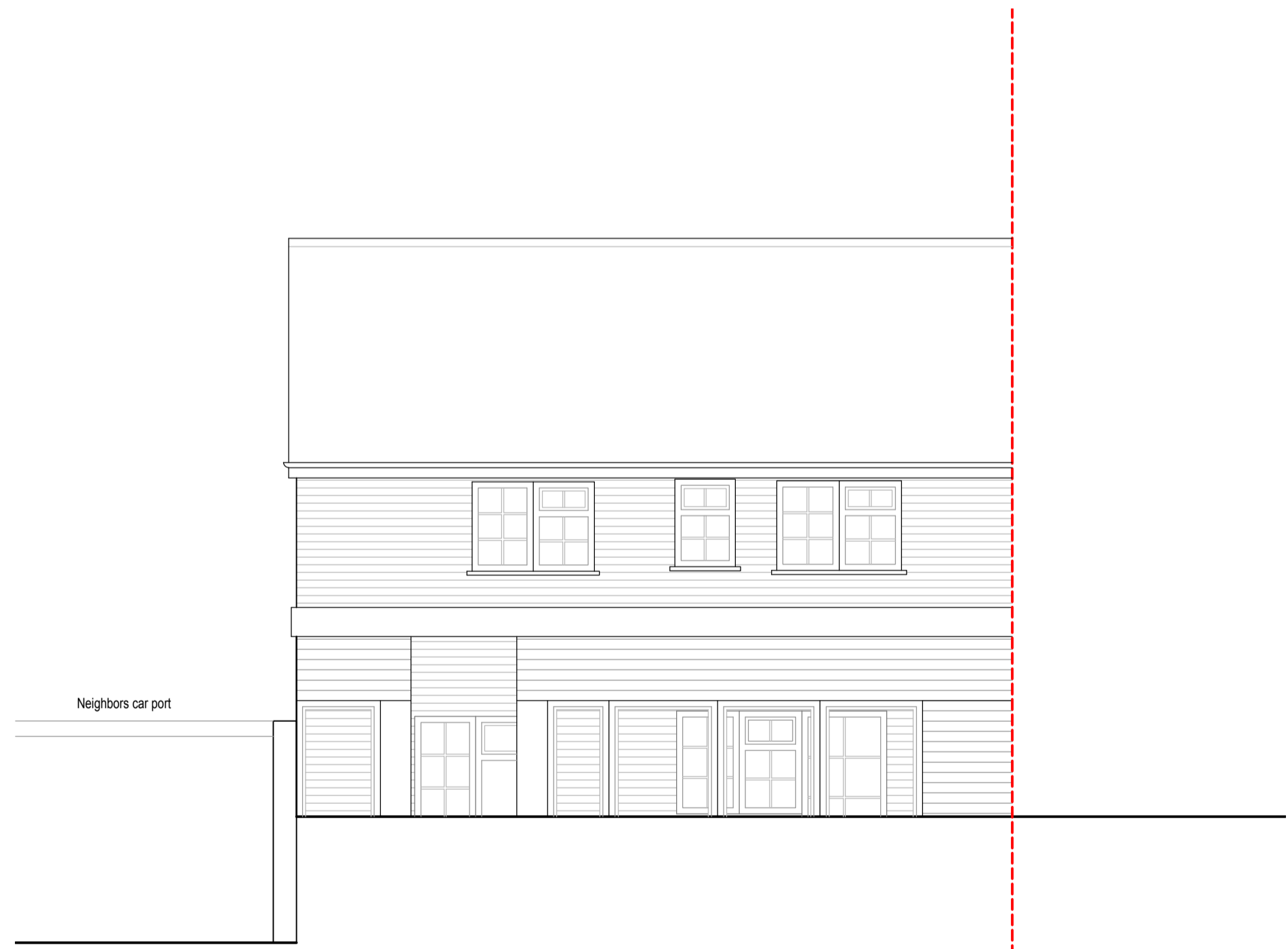
Existing North elevation Scale 1:50