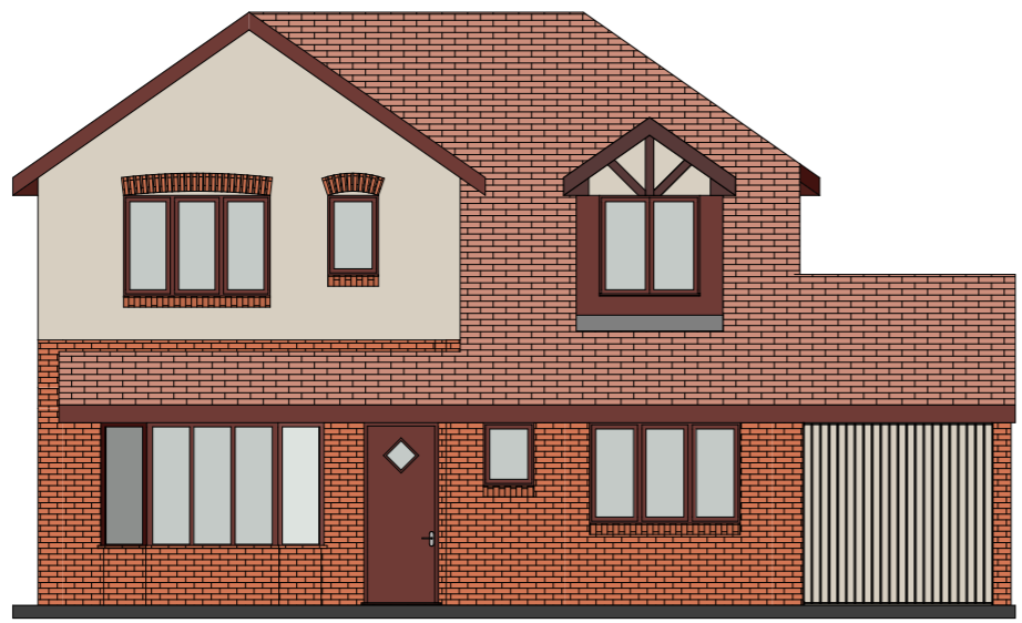
1 Proposed Front Elevation 1:100