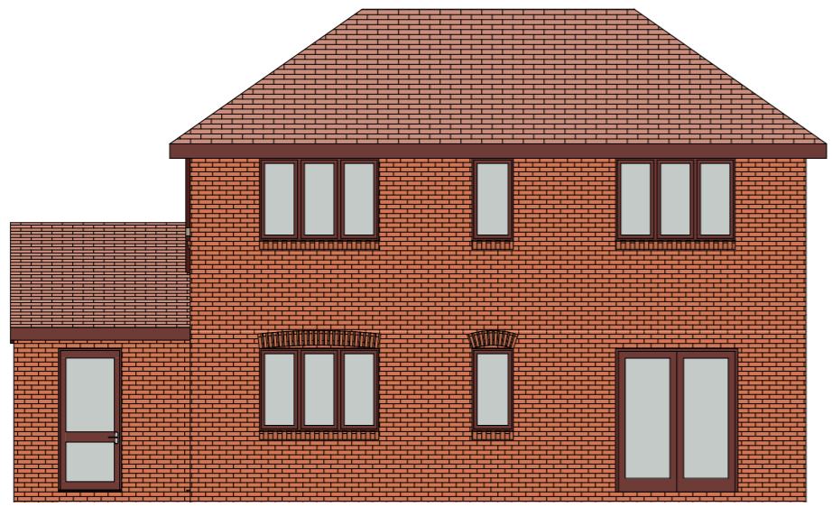
3 Proposed Rear Elevation 1:100