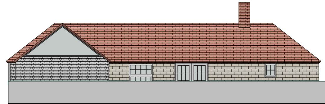
4 Proposed West Elevation 1:100

C:\Users\jonathanchilds\Documents\WORK\JCA\Projects\Current Jobs\Tollhouse Cottage, Faversham\Tollhouse Cottage, Faversham inc. bathroom and utility 4.pln