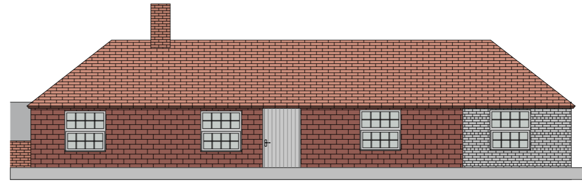
2 Proposed East Elevation 1:100