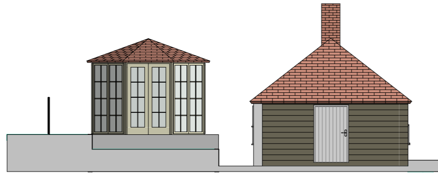
Existing South Elevation 1:100