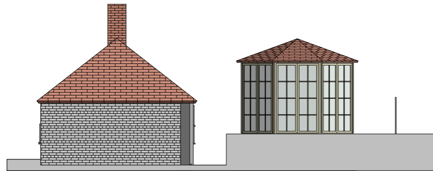
Existing North Elevation 1:100