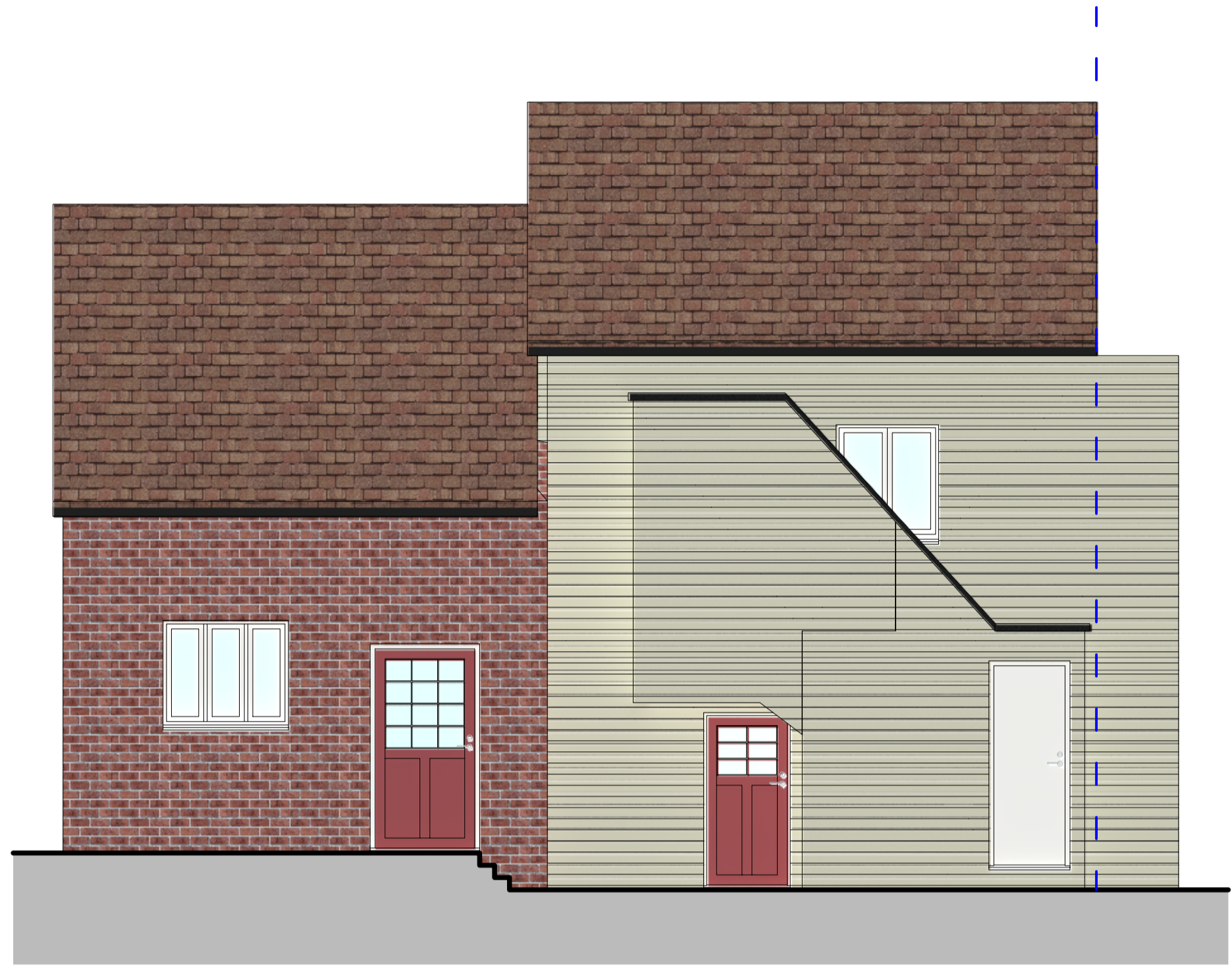
Existing North (front) Elevation