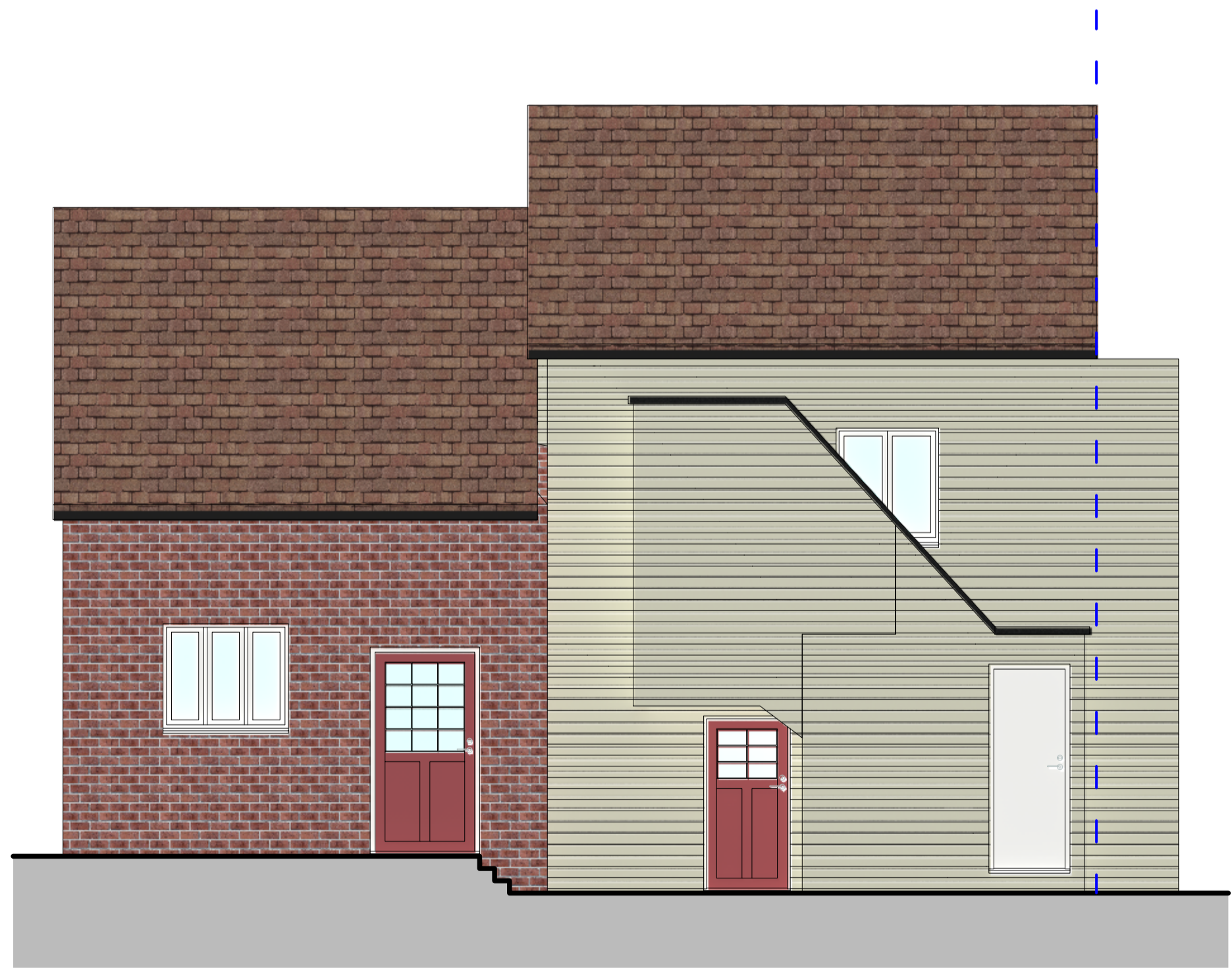
Proposed North (front) Elevation