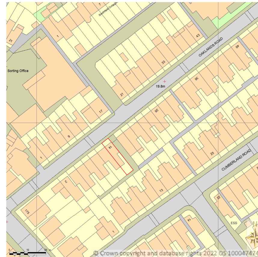
Location Plan @ 1:1250