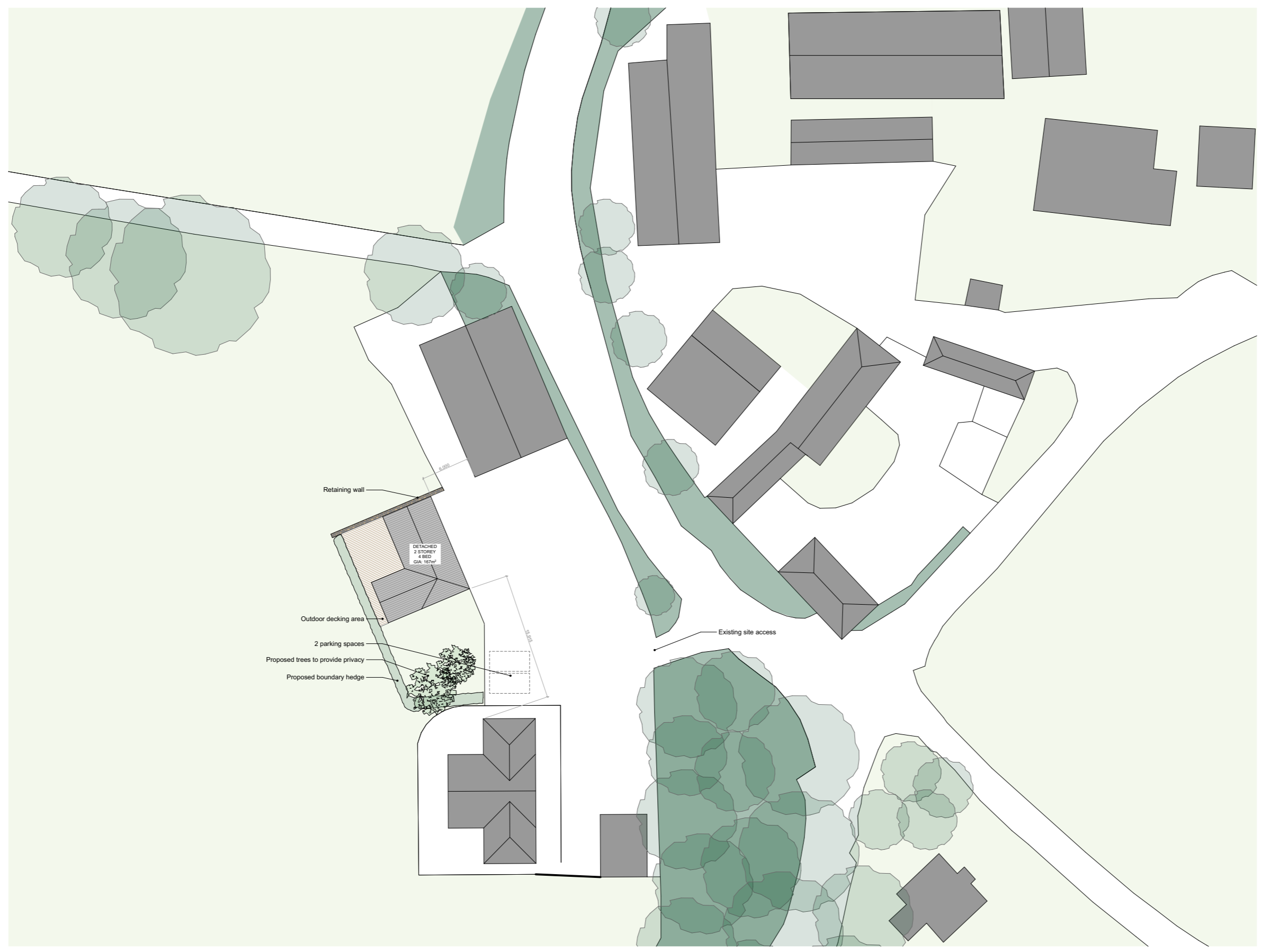
INDICATIVE SITE PLAN 1:500 1:500 0 5m 10m 20m