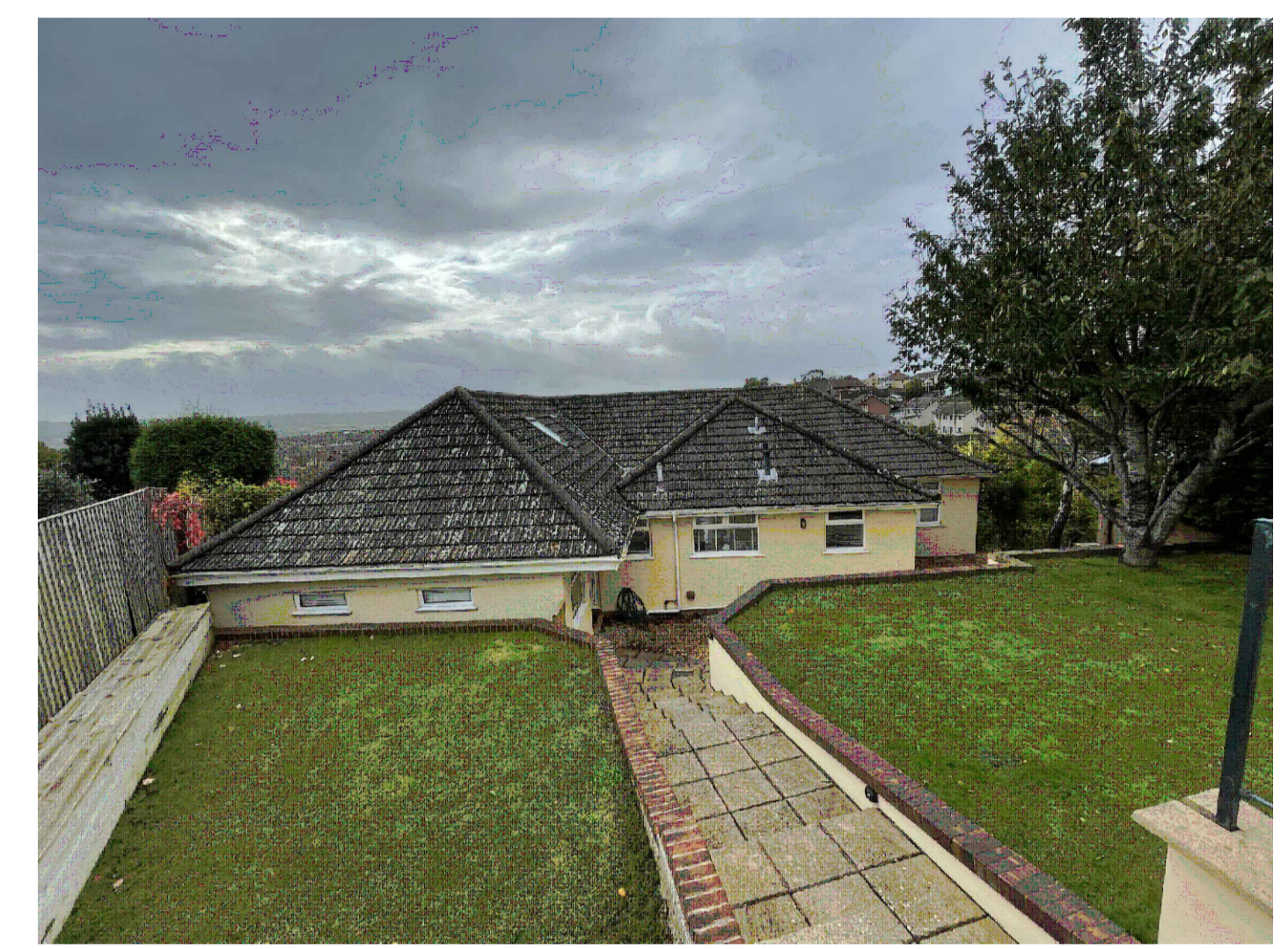
West Elevation (NTS) (Unaffected by proposals)