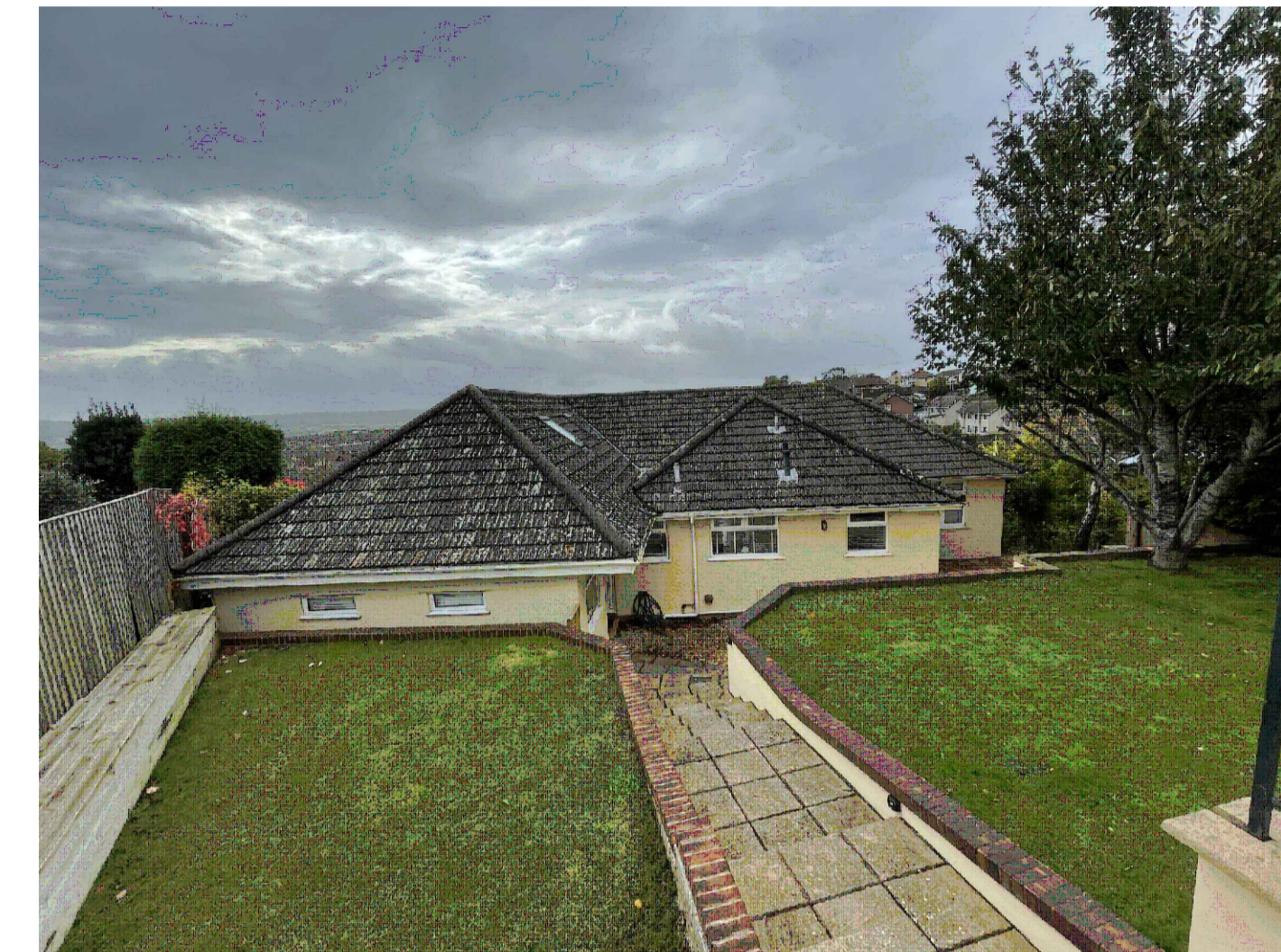
West Elevation [NTS] (Unaffected by proposals)