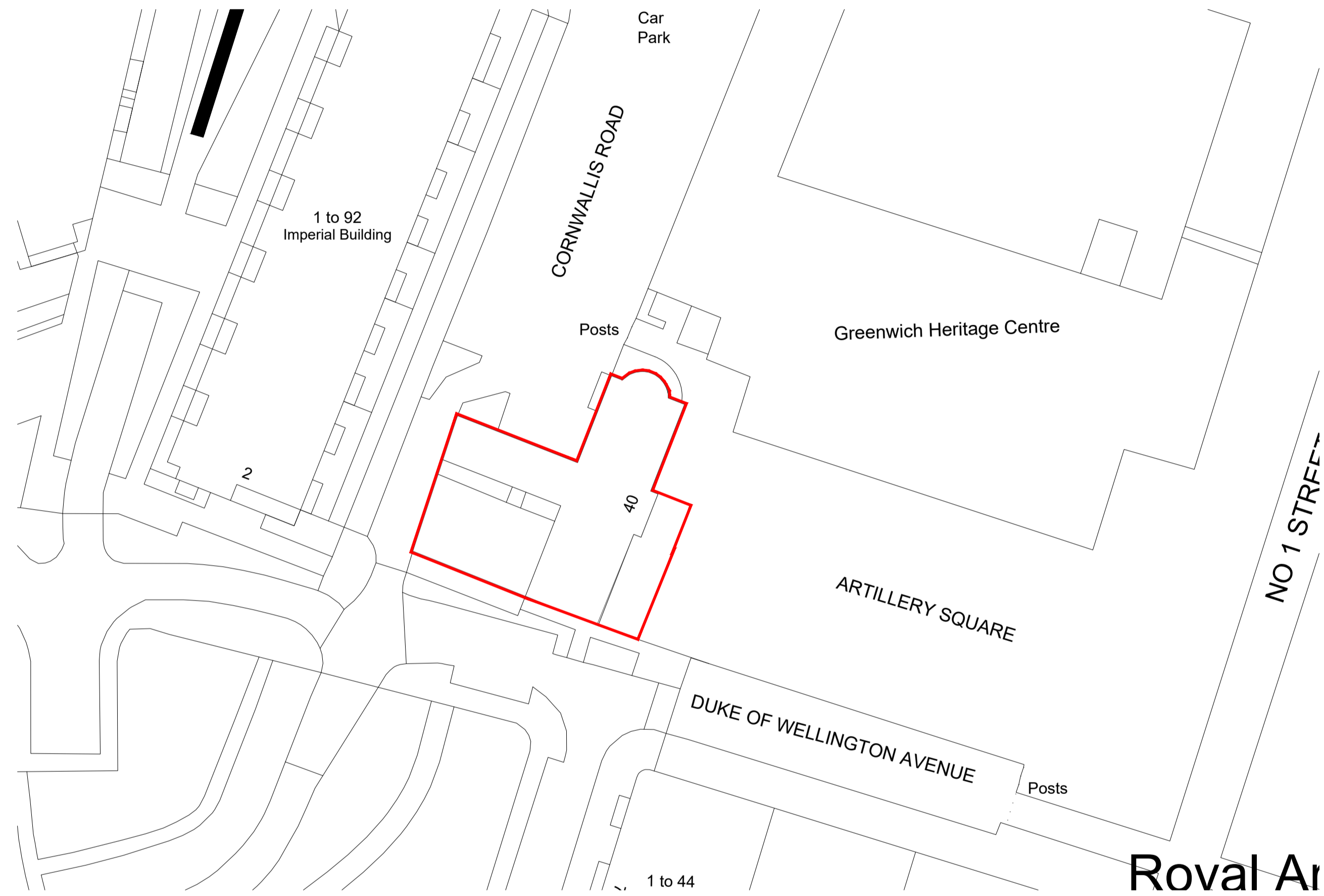
BLOCK PLAN - AS PROPOSED SCALE @ 1:500 ON AN A1 SHEET