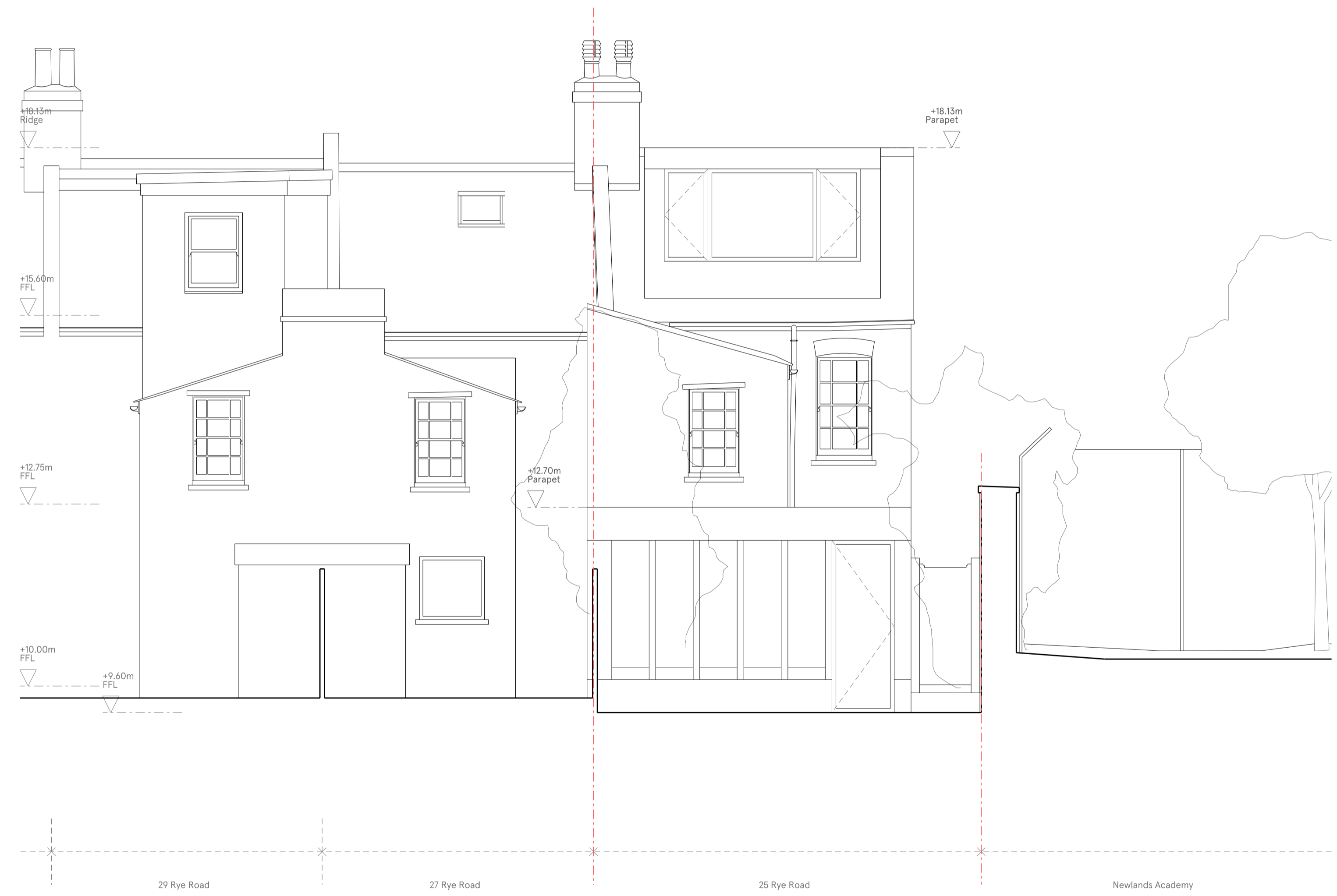
02 North-east Elevation