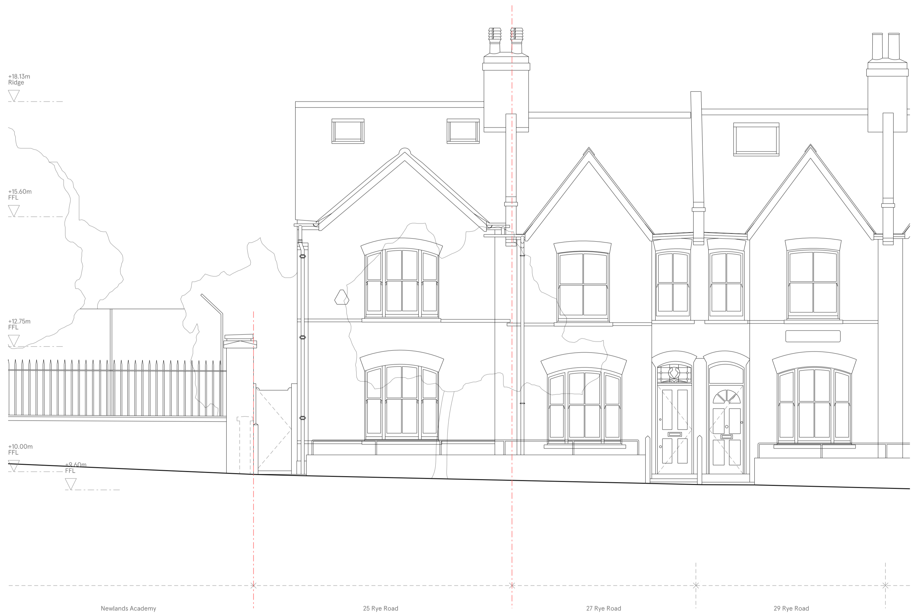
01 South-west Elevation