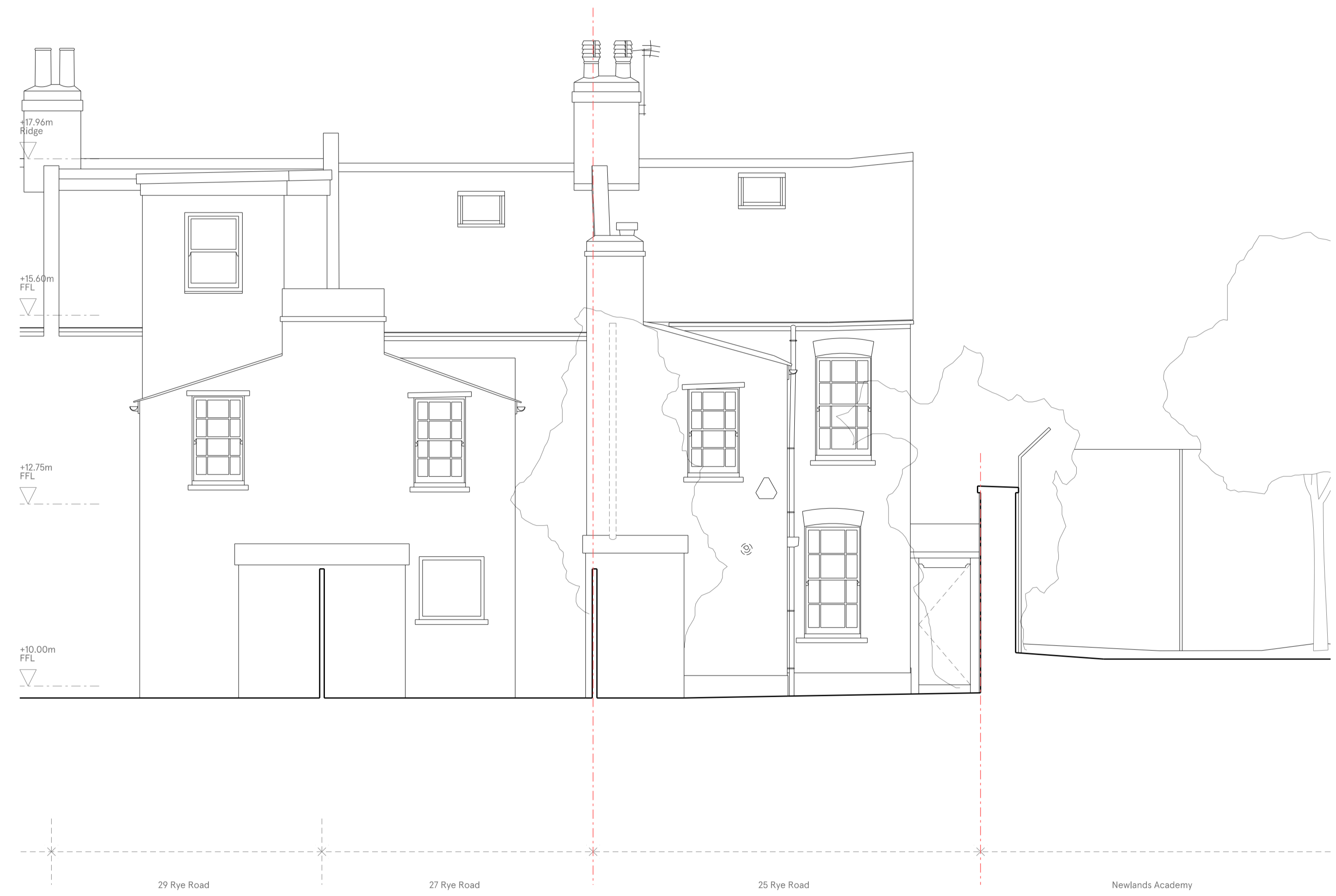
02 North-east Elevation