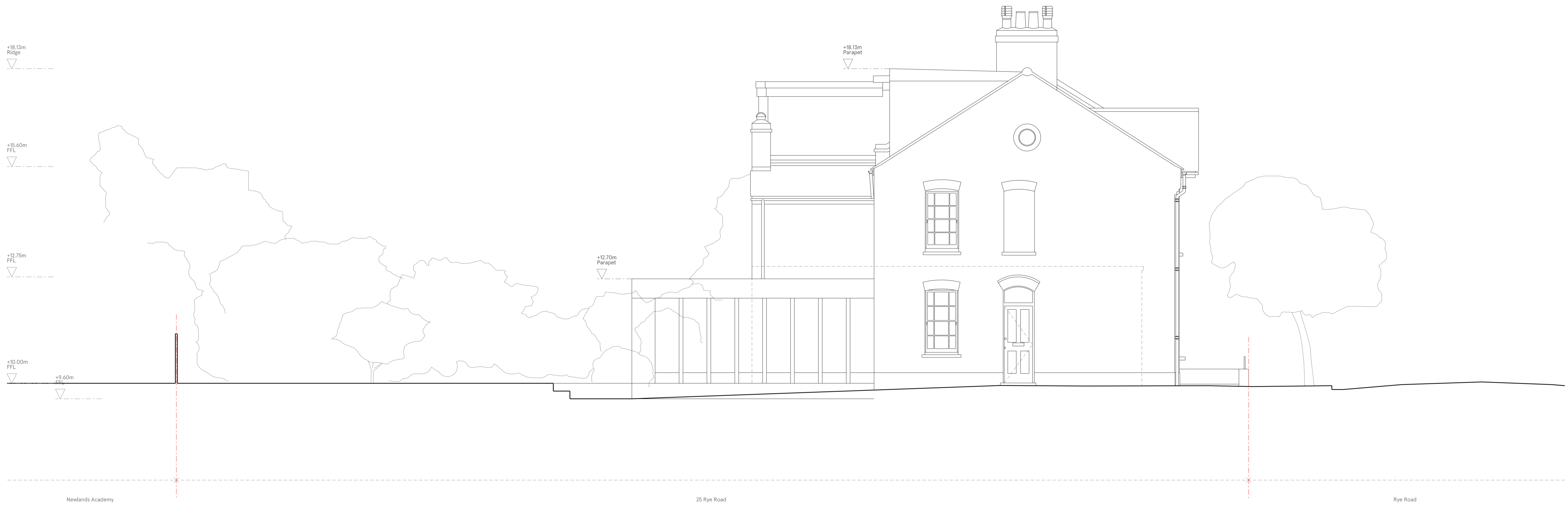
01 North-west Elevation