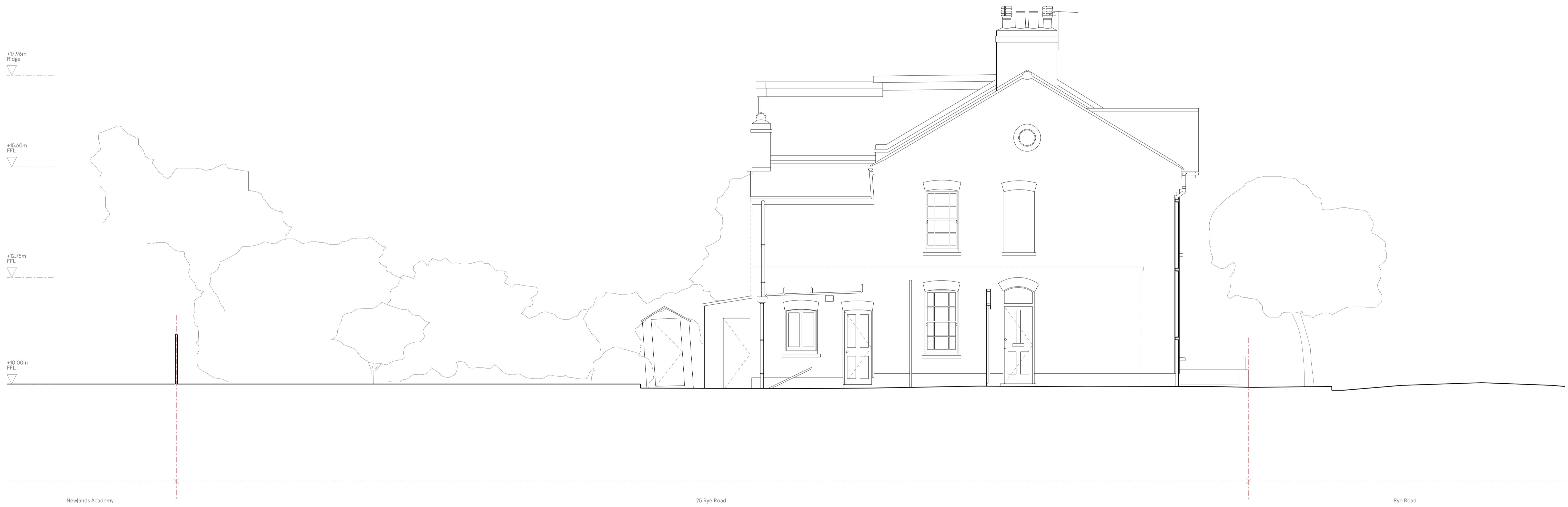
01 North-west Elevation