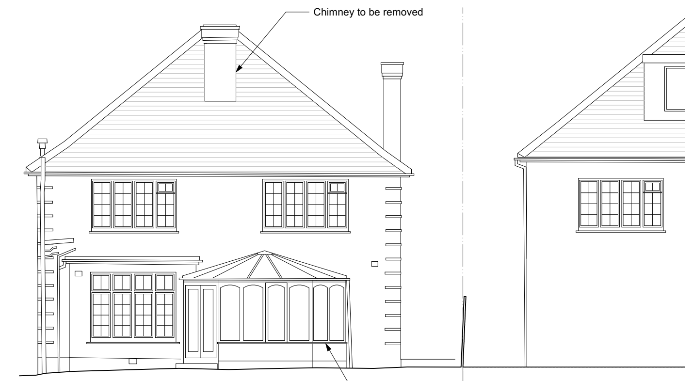
2 Existing Rear Elevation Scale: 1:100