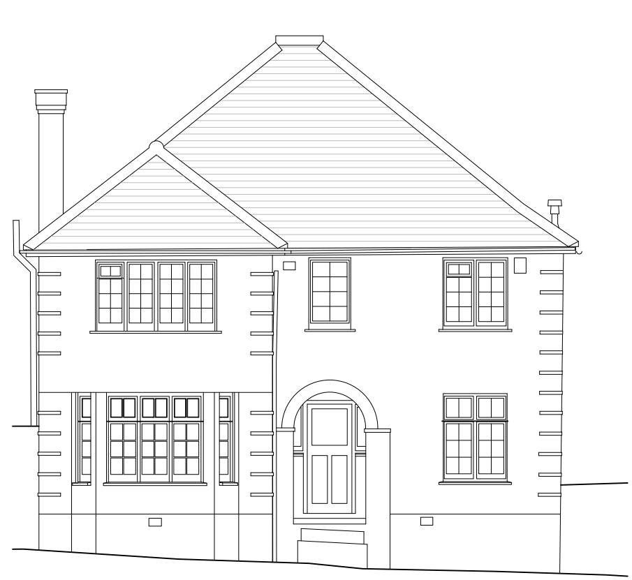
1 Existing Front Elevation Scale: 1:100