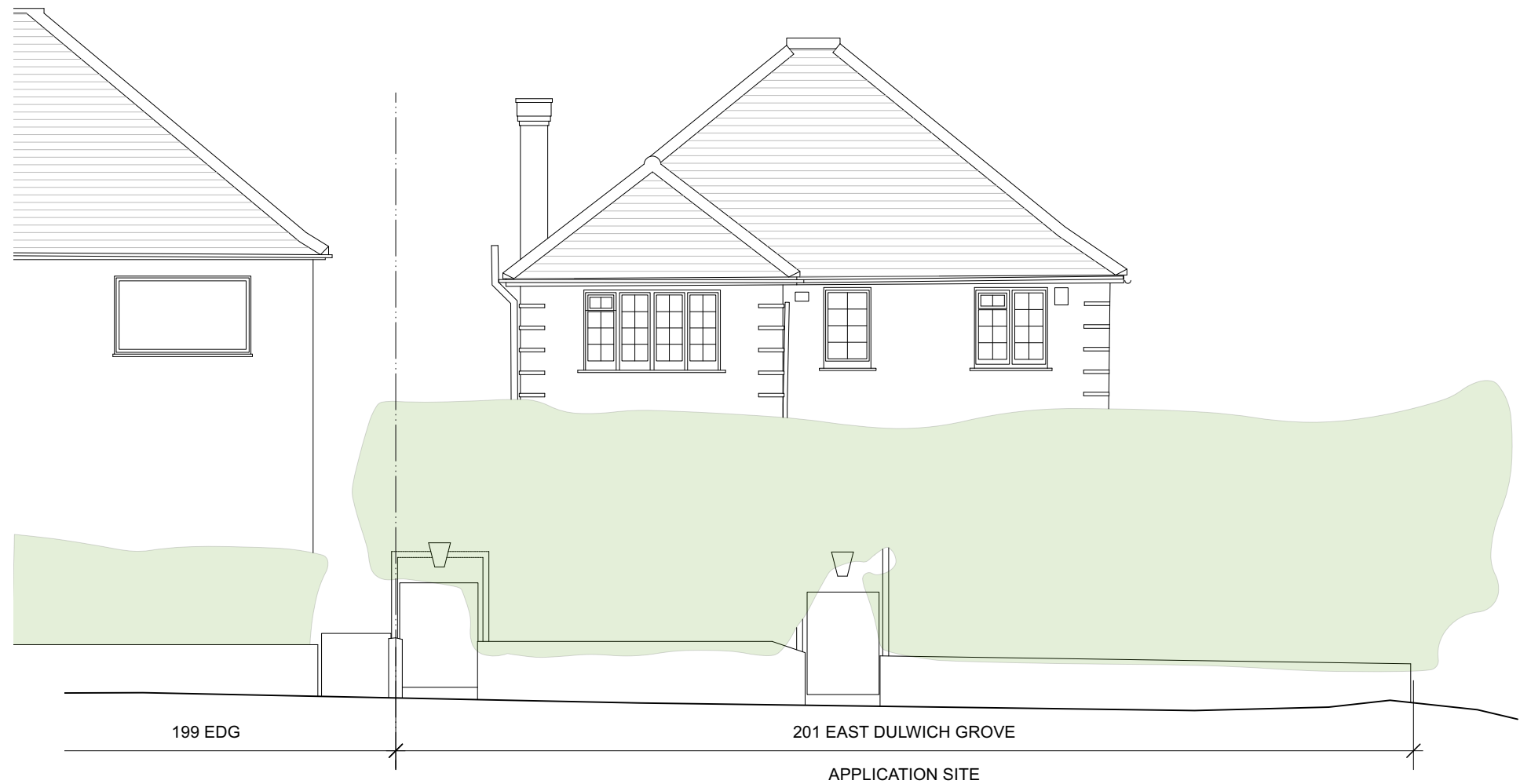
1 Existing Front Street Elevation Scale: 1:100